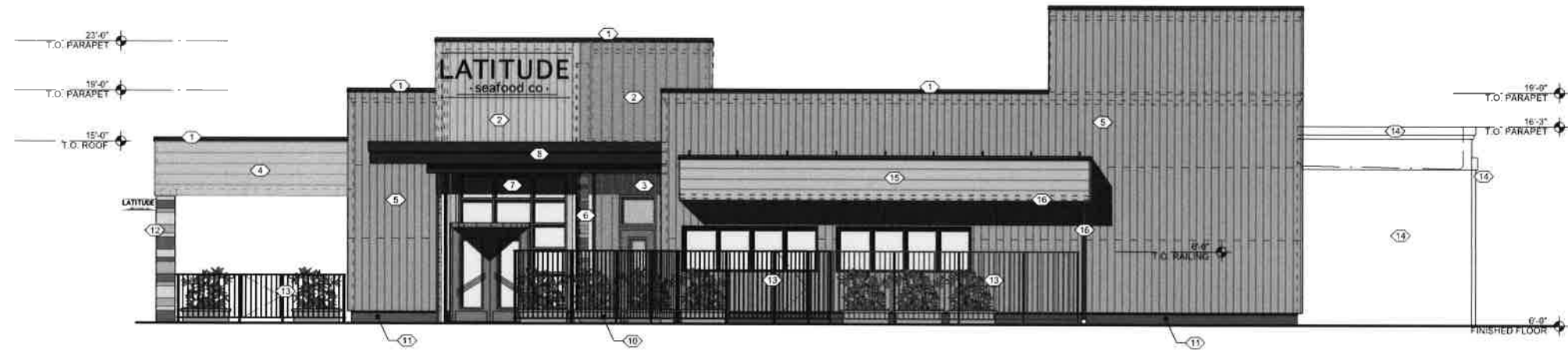
PROPOSED EXTERIOR ELEVATION - SOUTH ② 3/16 = 1'-0"