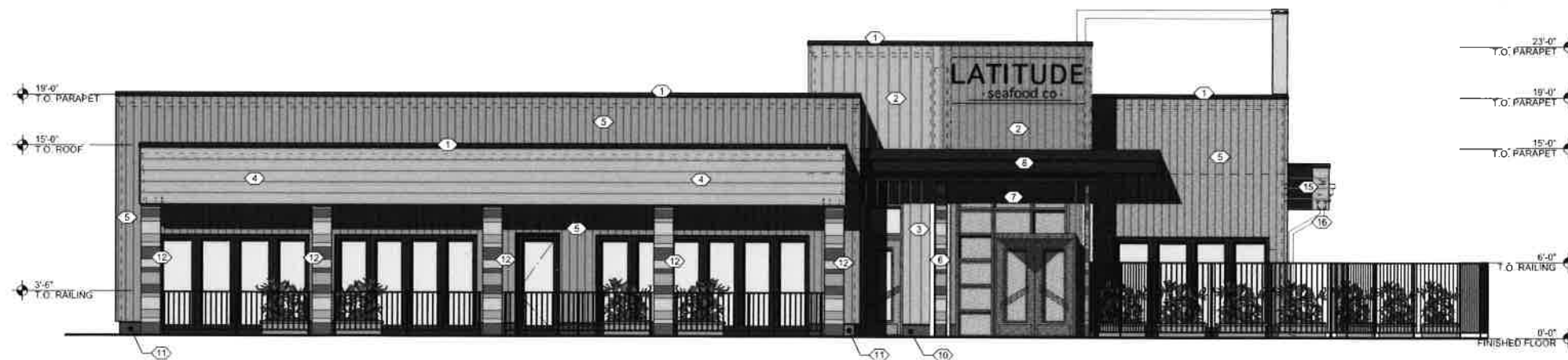
PROPOSED EXTERIOR ELEVATION - EAST ① 3/16 = 1'-0"