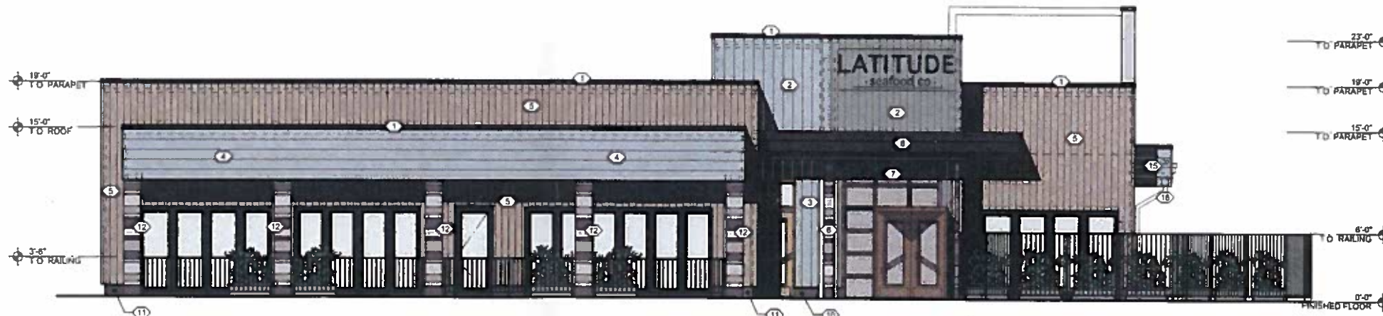
PROPOSED EXTERIOR ELEVATION - EAST 1 3/16 = 1'-0"