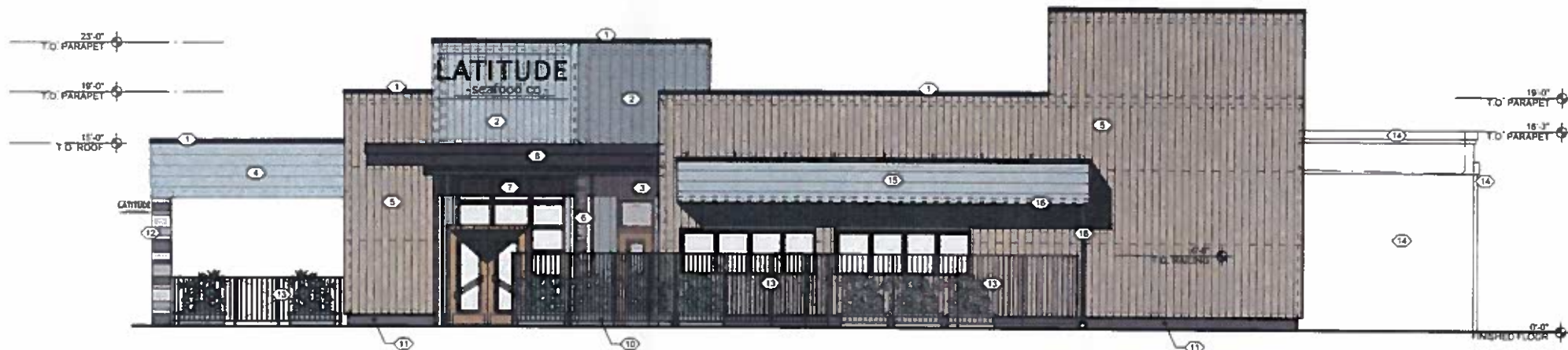
PROPOSED EXTERIOR ELEVATION - SOUTH 2 3/16 = 1'-0"