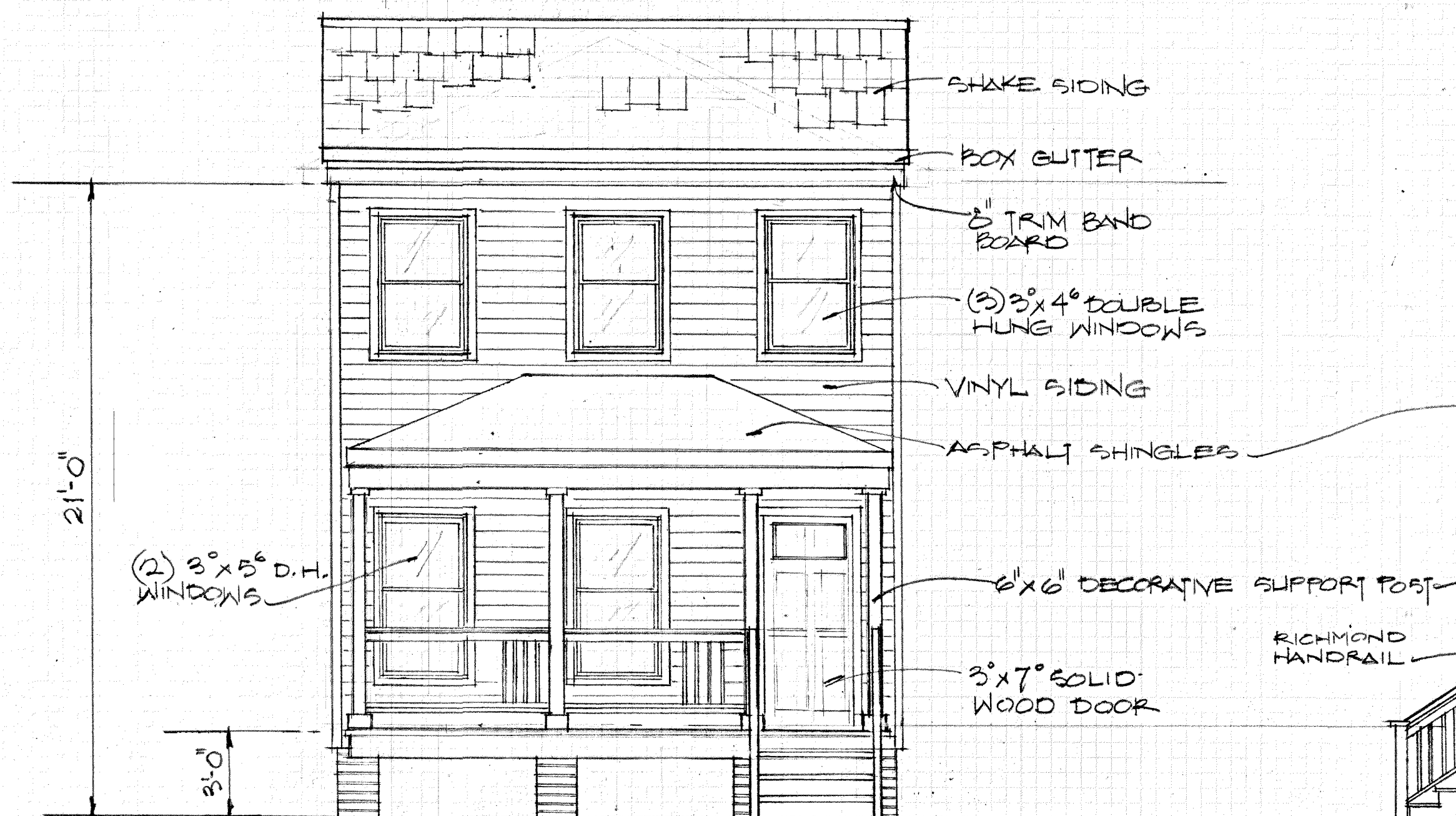
FRONT ELEVATION 1/4"=1'-0"