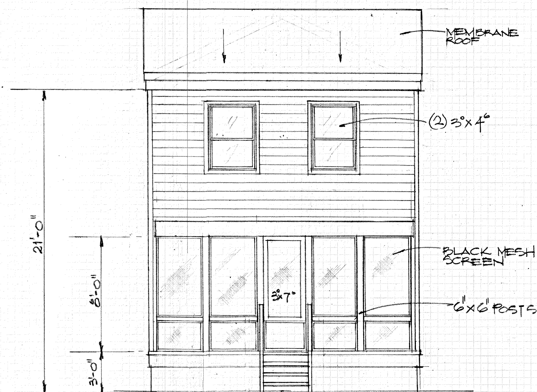
REAR ELEVATION 1/4"=1'-0"