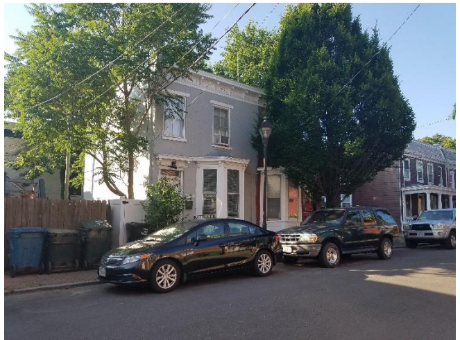
Figure 6. 500 block St. James St, odd side