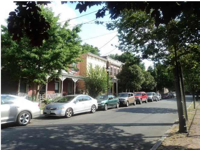
Figure 5. 500 block St. James St, odd side