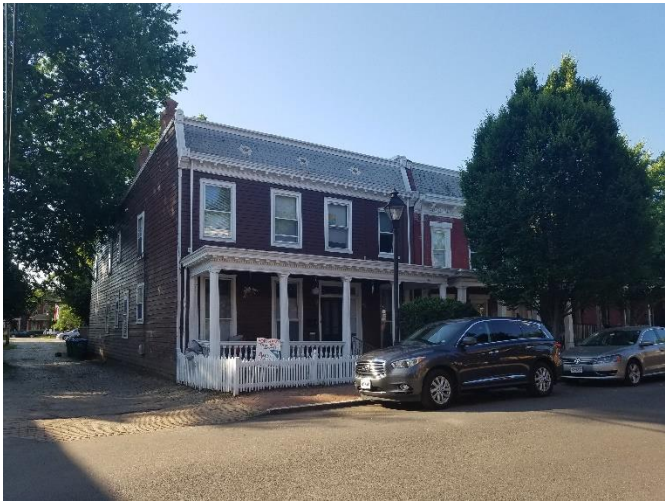
Figure 3. 500 block St. James St, odd side