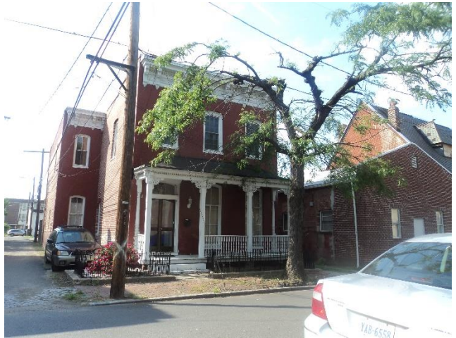
Figure 4. 500 block St. James St, even side