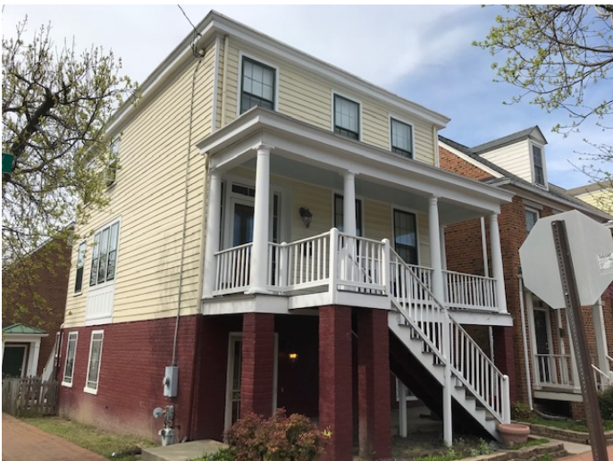
Figure 3. 500 North 24th St