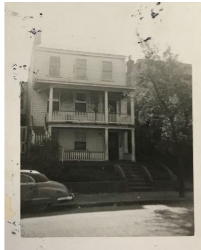
Figure 4. 511 North 24th St, ca. 1956