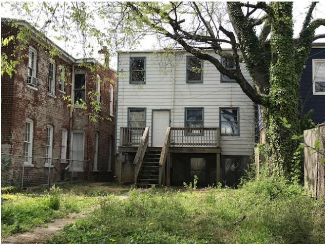
Figure 5. 511 North 24th St, rear