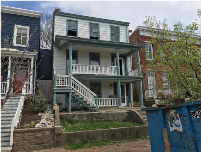
Figure 1. 511 North 24th St, façade