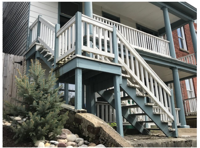
Figure 2. Front porch steps detail