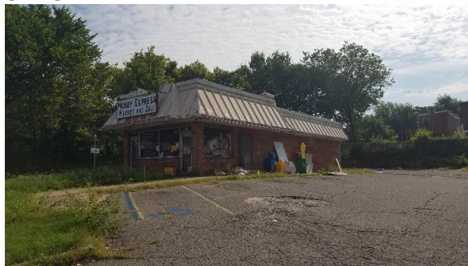
Figure 2. 715 Mosby Street, right elevation.