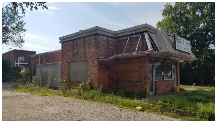
Figure 4. 715 Mosby Street, left elevation.