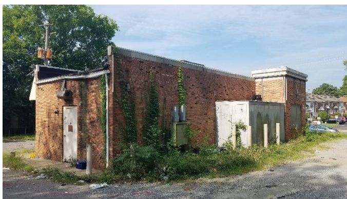
Figure 3. . 715 Mosby Street, rear elevation.