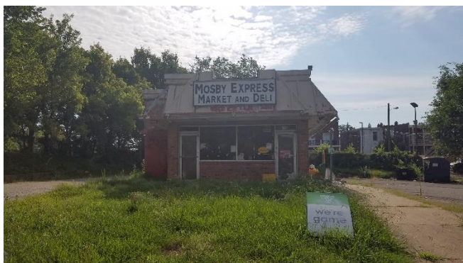
Figure 1. 715 Mosby Street, facade.