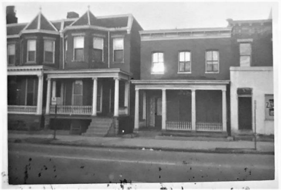
Figure 1. 14 1/2 West Leigh Street, ca. 1940.