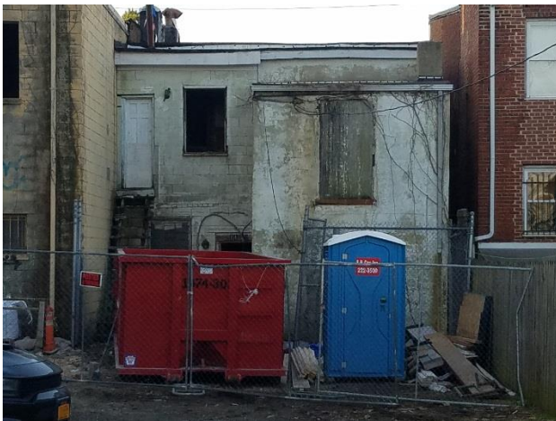
Figure 3. 14 1/2 West Leigh Street, rear elevation, current conditions.