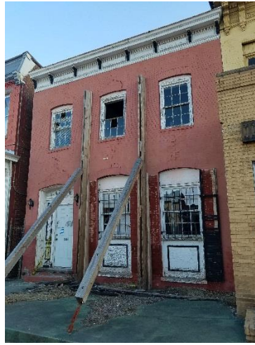
Figure 2. 14 1/2 West Leigh Street, current conditions.