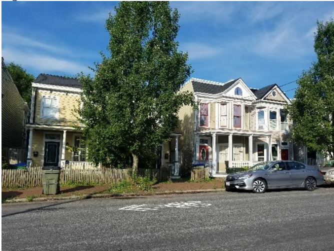
Figure 3. 33013-3015 and 3011 East Marshall Street.