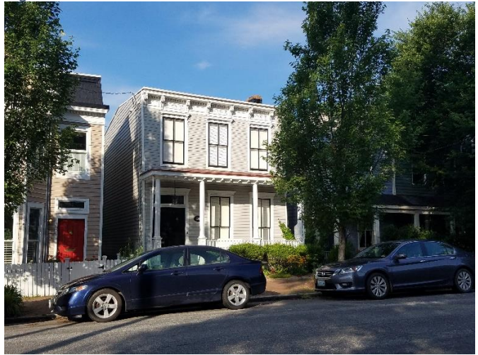
Figure 4. 3007 East Marshall Street.