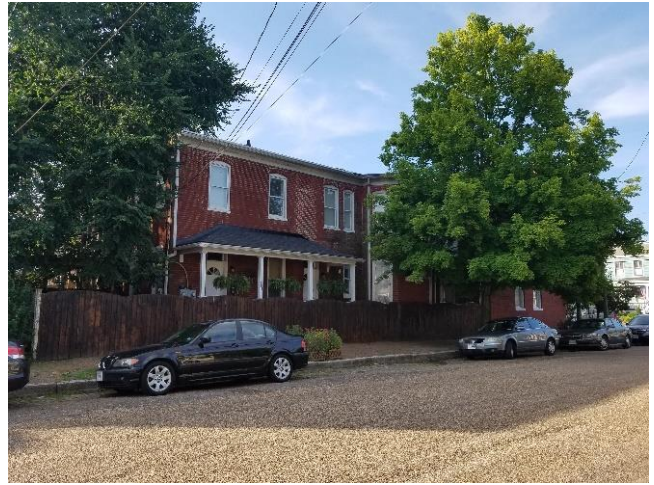
Figure 8. 3100 East Broad/3013-303 North 31st Street.