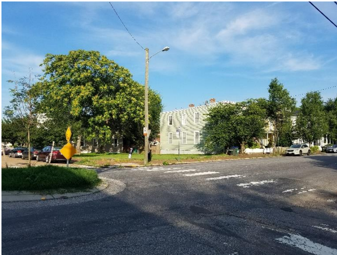
Figure 1. 3019-3021 East Marshall Street.