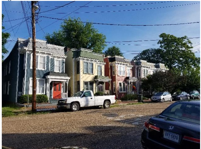
Figure 6. 300 block of North 31st Street.