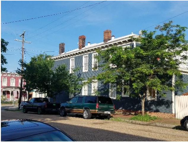
Figure 7. 3020 East Broad Street, North 31st Street elevation.