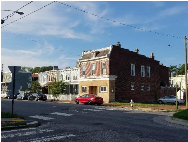
Figure 5. 3100 block of East Marshall Street.