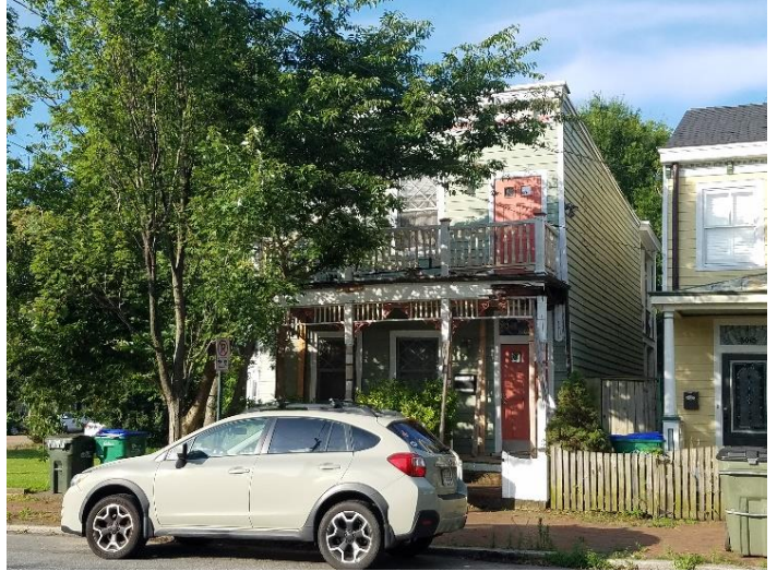
Figure 2. 3017 East Marshall Street.