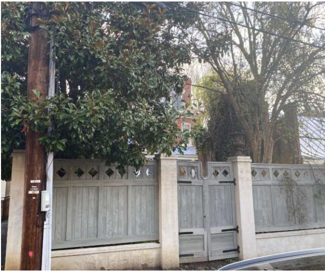
Figure 3. Visibility of rear from alley, 2021