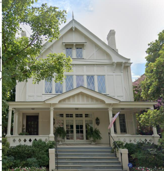
Figure 2. Existing façade, rear portico to match front portico.