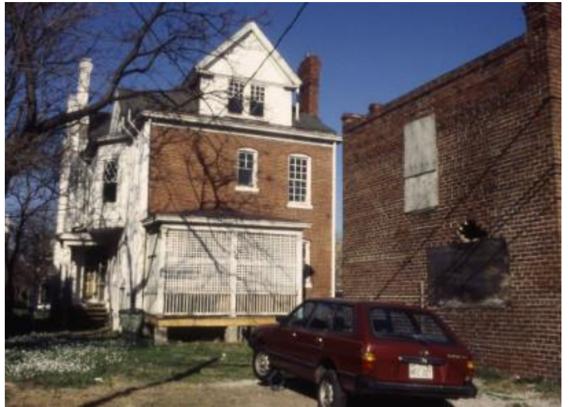
Figure 4. Historic photo of rear.