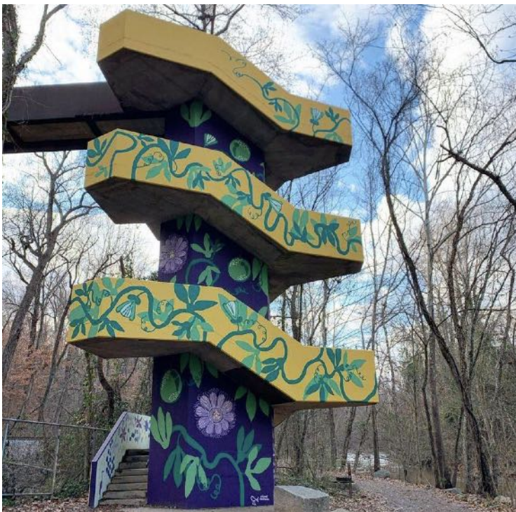
James River Park System Tower, painted 2022 with teens.