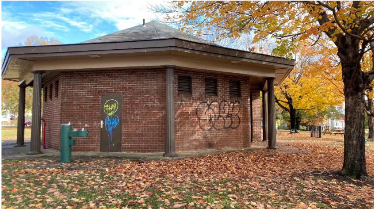
Brick and mortar detail (vandalism in white chalk)