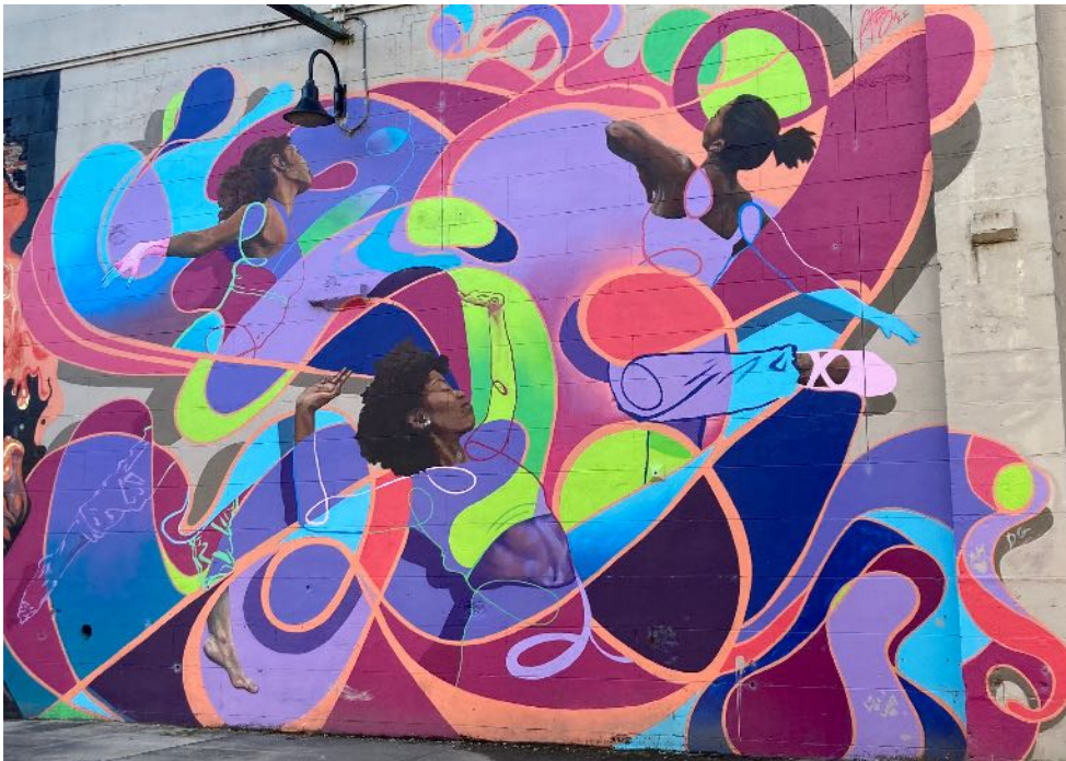
Auz' Power Plant Mural, painted 2022, RVA Street Art Festival

In Austin's community practice as a public artist, she has installed numerous national murals in Richmond, VA; Norfolk, VA; Durham, NC; Cleveland, OH; and Magnolia, MS.