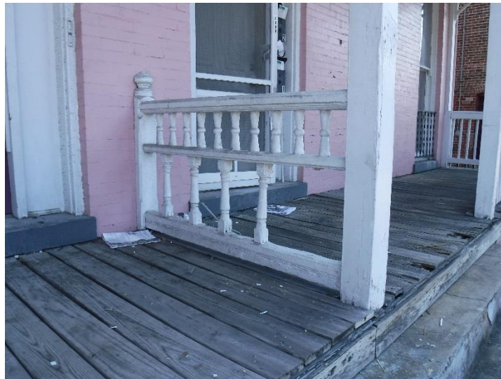
Surviving Railing at 2406-2408 E. Clay Street (March 2018)

Porch: The Richmond Old and Historic District Handbook and Design Review Guidelines state available documentation including pictorial, historical or physical documentation should be used when reconstructing missing elements (pg. 59, #7). The proposed replacement roof matches the identical adjacent structure and is based on photographic evidence of the historic roof form. Staff supports the proposed design and materials for the new roof and encourages the applicant to consider restoring the spindle work frieze and sawn brackets as a part of this rehabilitation. Staff supports the replacement of the modern wood decking boards with wood tongue and groove decking boards as are found on historic properties in the district. The applicant has provided photographs of the historic spindle work balustrade on the adjacent property, and the adjacent property still possesses one surviving section of historic balustrade. Staff recommends a balustrade to match that of the historic balustrade at the adjacent identical property be installed on the porch rather than the proposed Richmond rail.