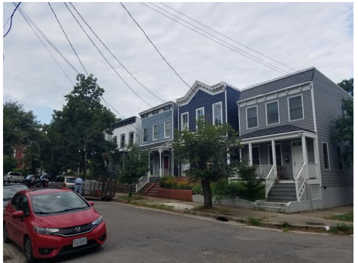
Figure 4. Curbing along the even side of North 36th Street