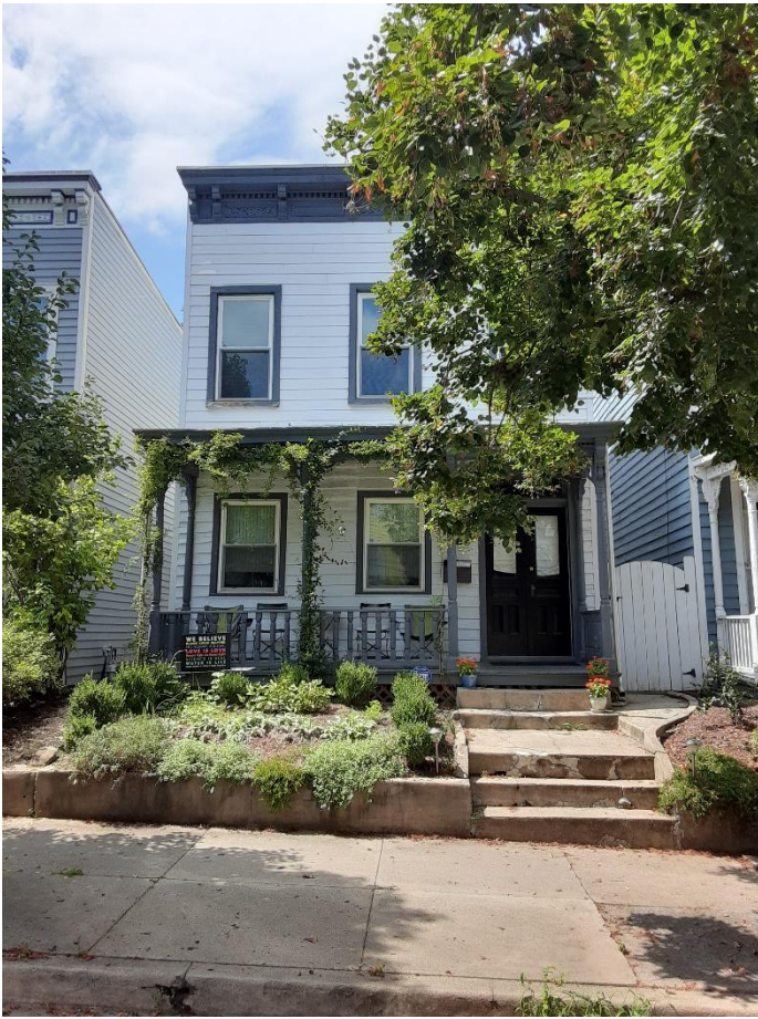
Figure 1. 316 North 36th Street, view from street