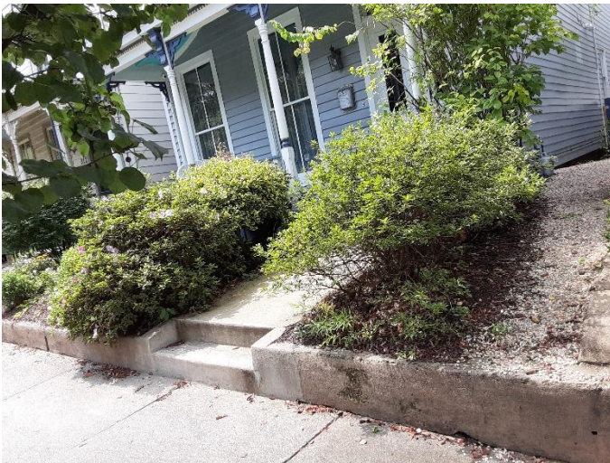
Figure 3. Curbing along the even side of North 36th Street