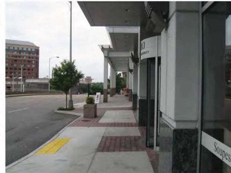
VIEW LOOKING SOUTH ALONG 10TH STREET.