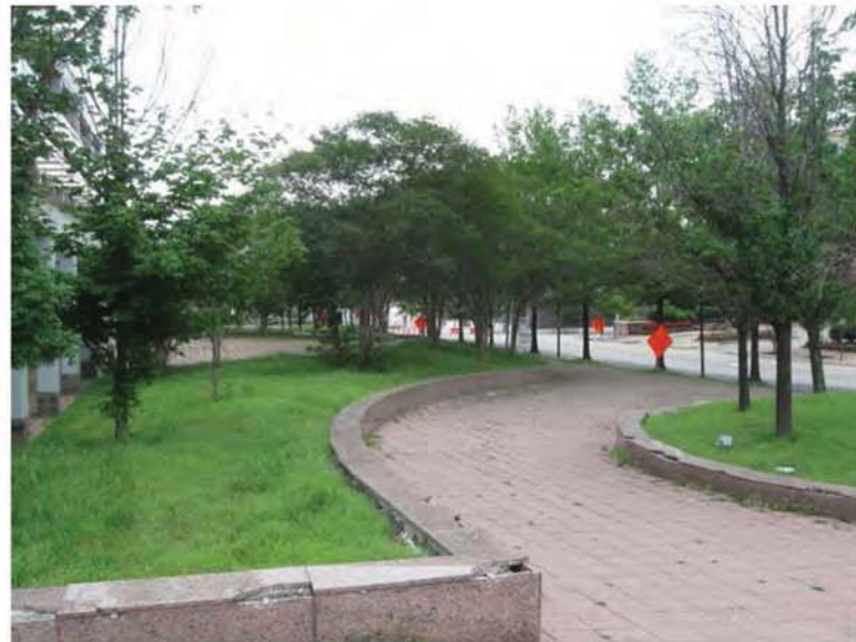
Looking across Plaza from 9th Street.