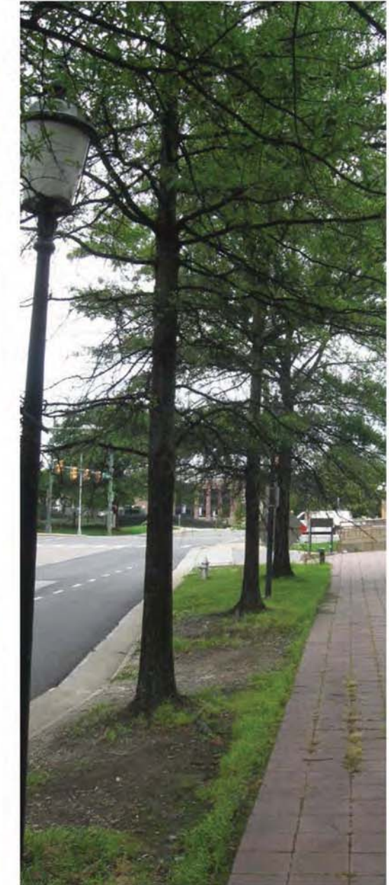
Existing trees along Byrd Street.