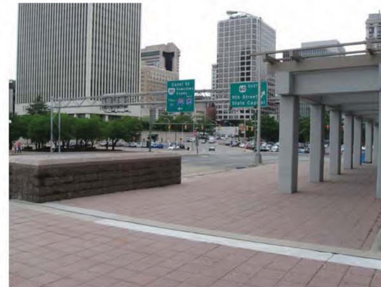
VIEW FROM PLAZA TOWARD 9TH STREET - CANAL STREET INTERSECTION