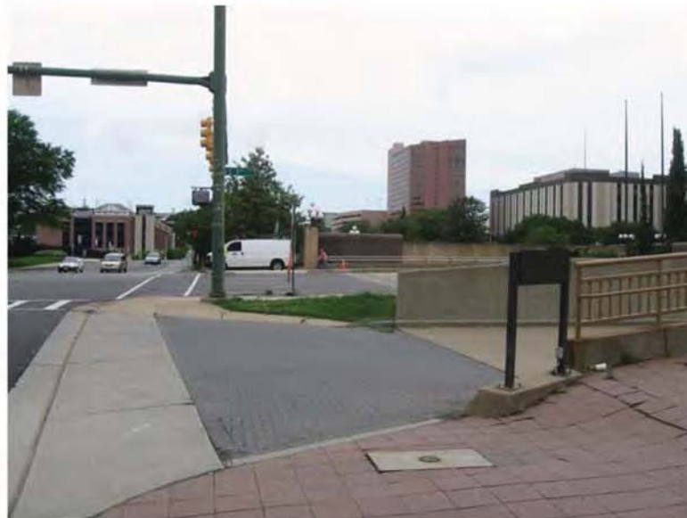
VIEW FROM PLAZA TOWARD 9TH STREET.