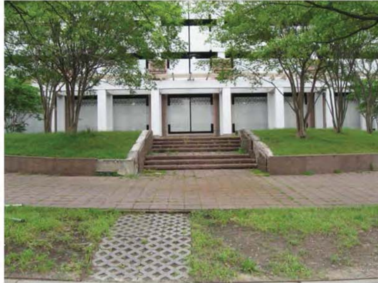
LOOKING ACROSS PLAZA FROM BYRD STREET.