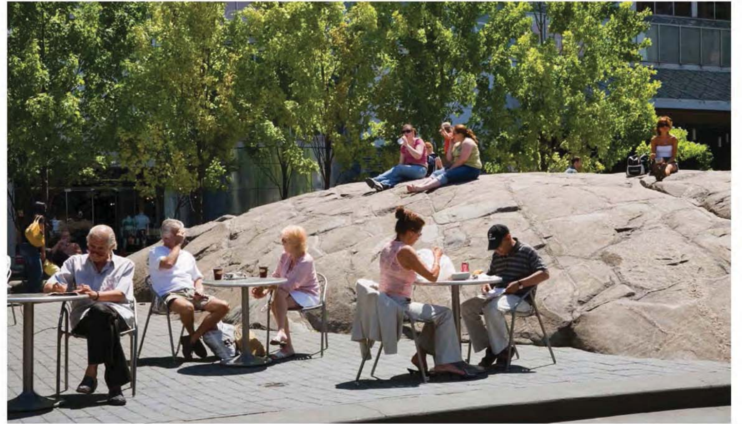
SEATING, VILLAGE OF YORKVILLE PARK