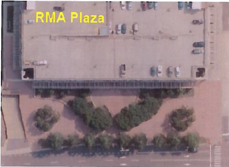
Map 1. RMA Plaza Replacement Project Area

The project area is bound on the west and east by 9 th and 10th Streets, and on the north and south by Canal and Byrd Streets.