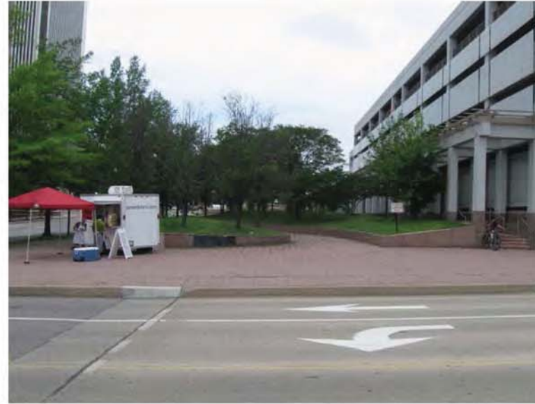
Looking across Plaza from 10th Street.