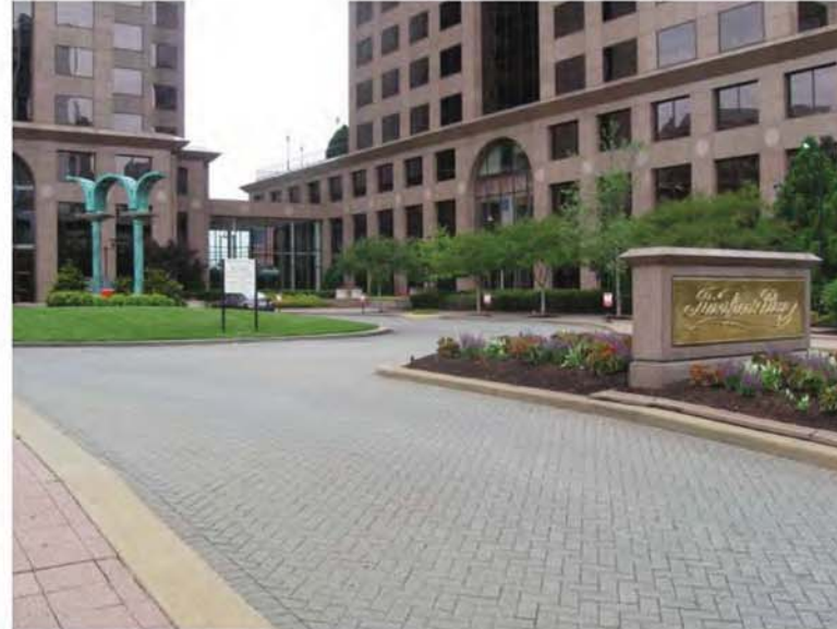
VIEW FROM PLAZA TO RIVERFRONT TOWERS.