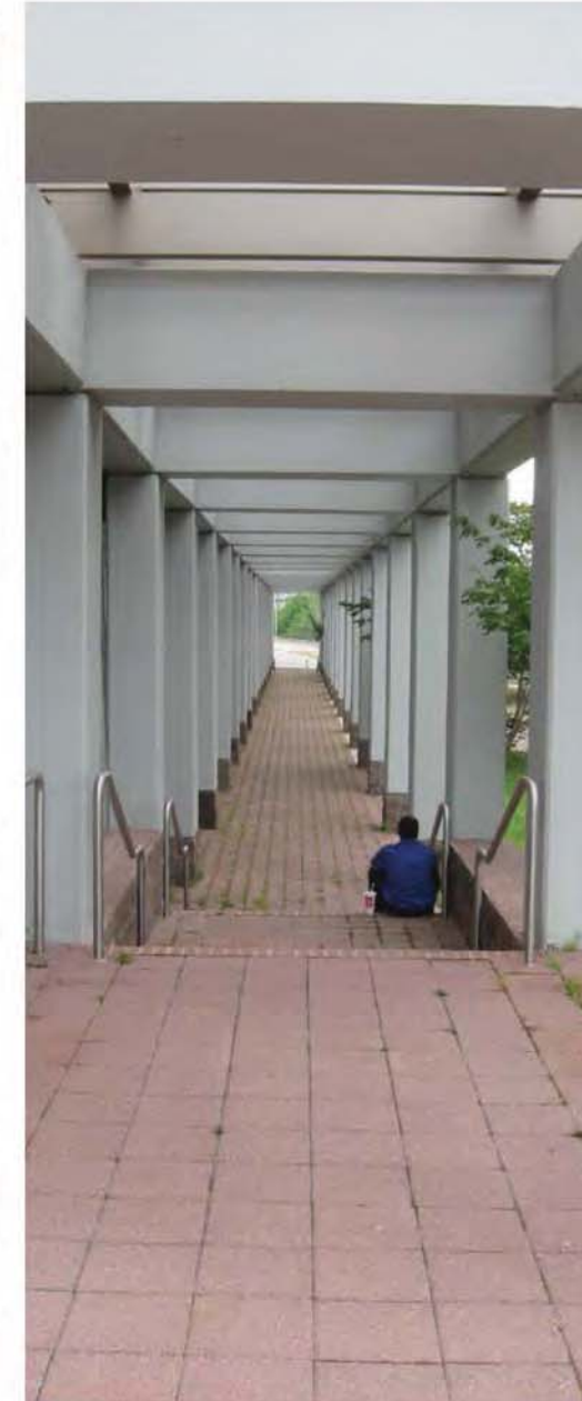
Existing pergola and walkway of north edge of Plaza.