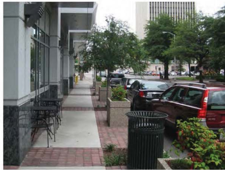
VIEW OF ADJACENT OUTDOOR DINING ALONG 10TH STREET.