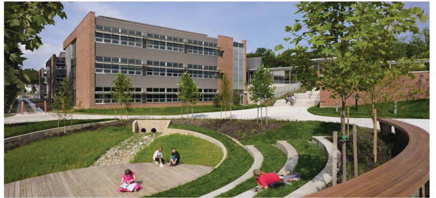
TERRACES, MANASSAS PARK