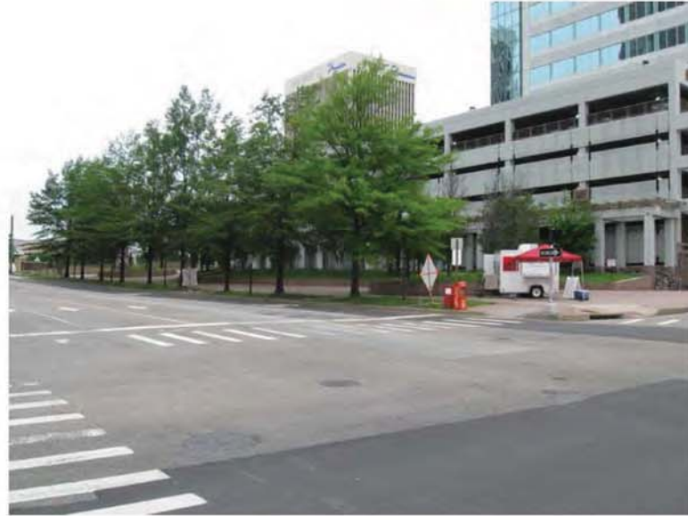
Looking northwest along Byrd Street.