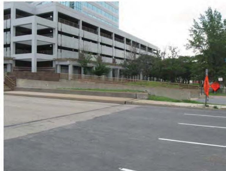
Looking at parking deck ramp at 9th Street.