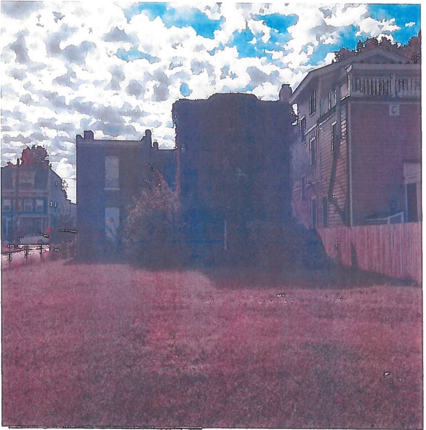
1201 Porter Street