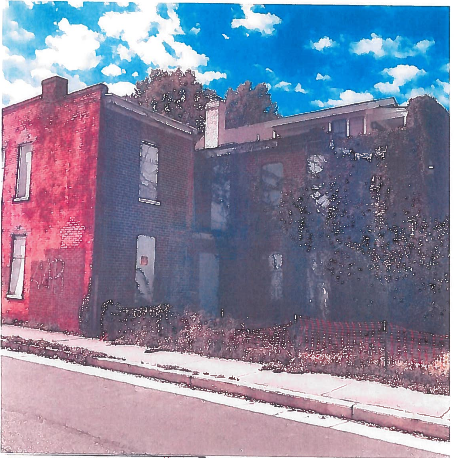
1201 Porter Street