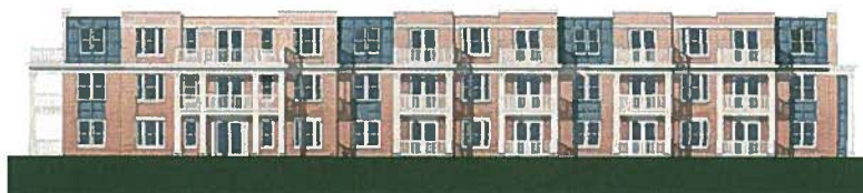
Elevation of Senior Apartment Building (Phase 1B)

Phase 2A consists of 70 rental units for families, including 17 Project Based Vouchers and 53 LIHTC units, with housing types similar to those in Phase 1A.