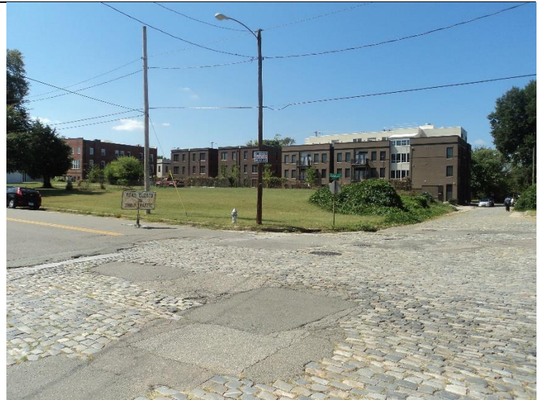
Figure 2. 2117-2219 Carrington Street.