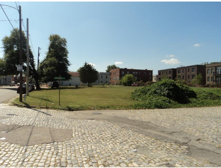
Figure 1. 2117-2119 Carrington Street.