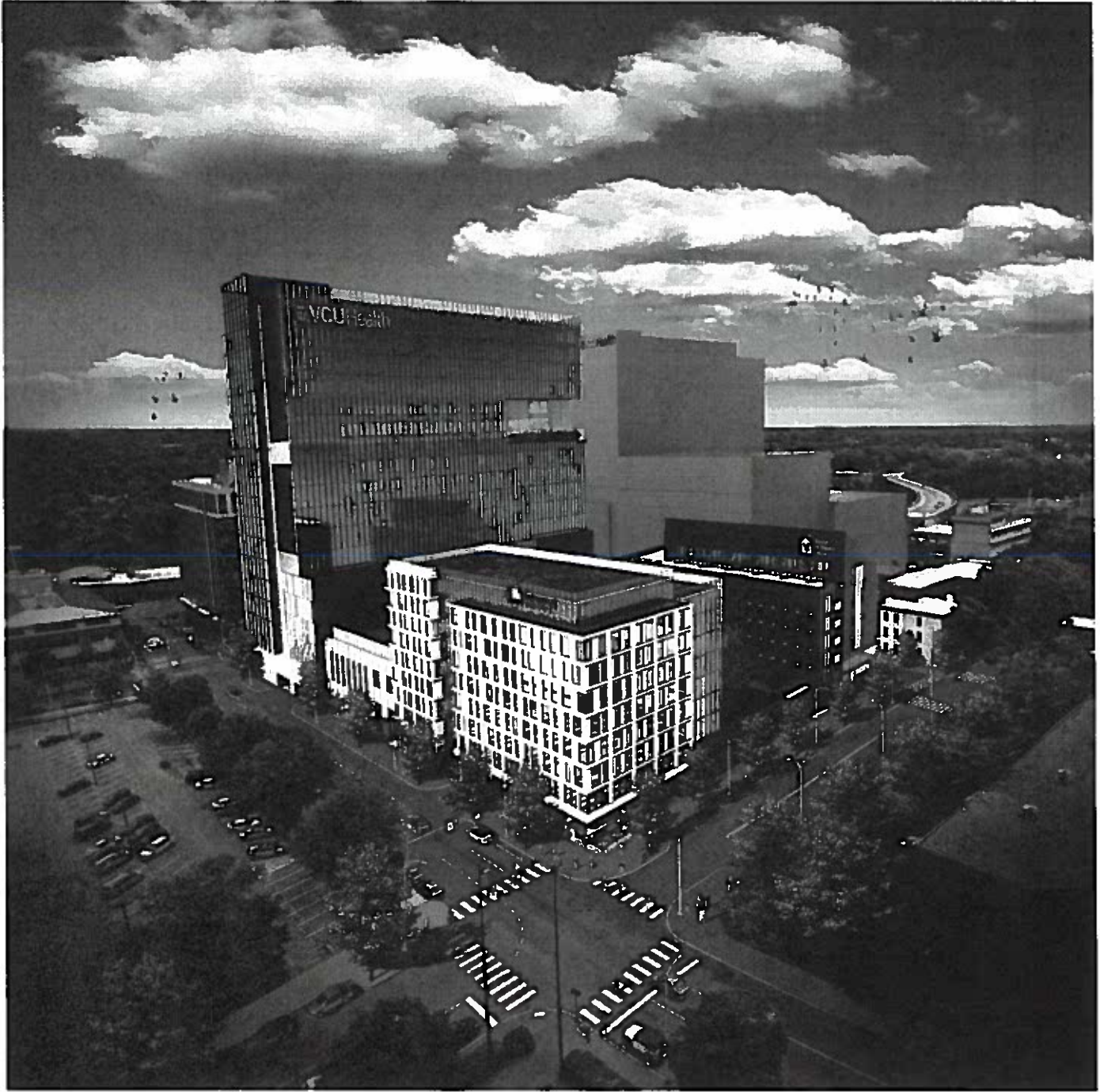
Exhibit C Project Rendering