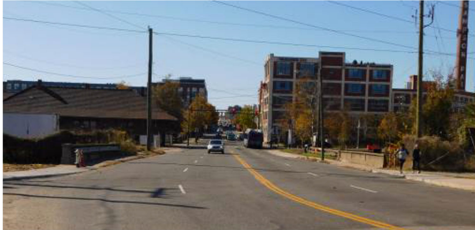
Figure 3 - Hull St over Manchester Canal looking south (Nov. 2021)