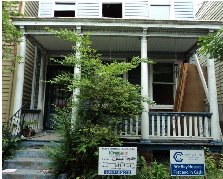
Figure 2. Front porch, May 2016