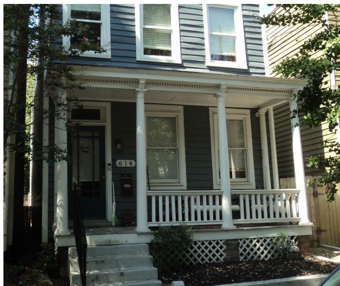
Figure 1. Front porch, September 2019