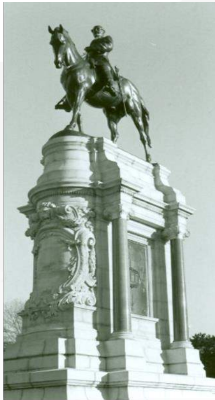
Robert E. Lee Monument Marius Jean Antonin Mercié Lee Circle, Monument Avenue (May 29, 1890)