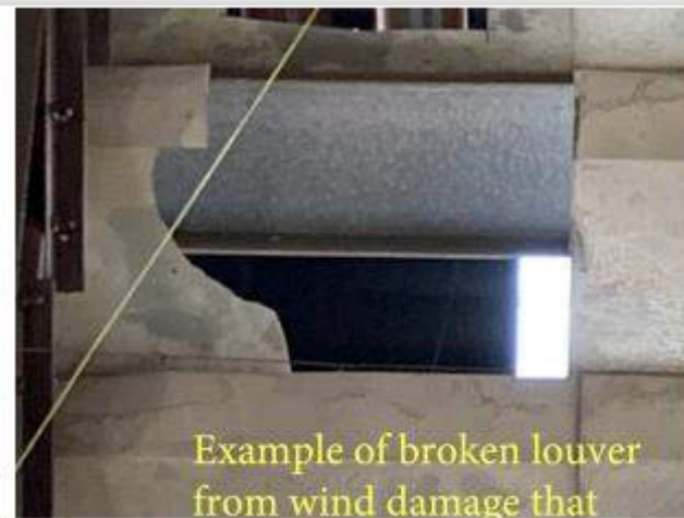
Example of broken louver from wind damage that