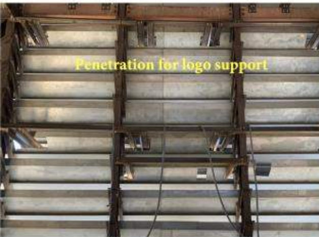
Penetration for logo support