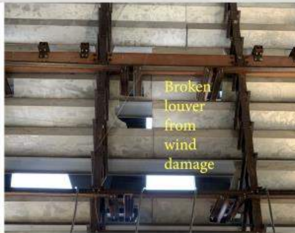
Broken louver from wind damage