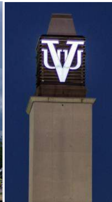
Robert L. Vann Memorial Tower Belgian Friendship Building Future of RVA