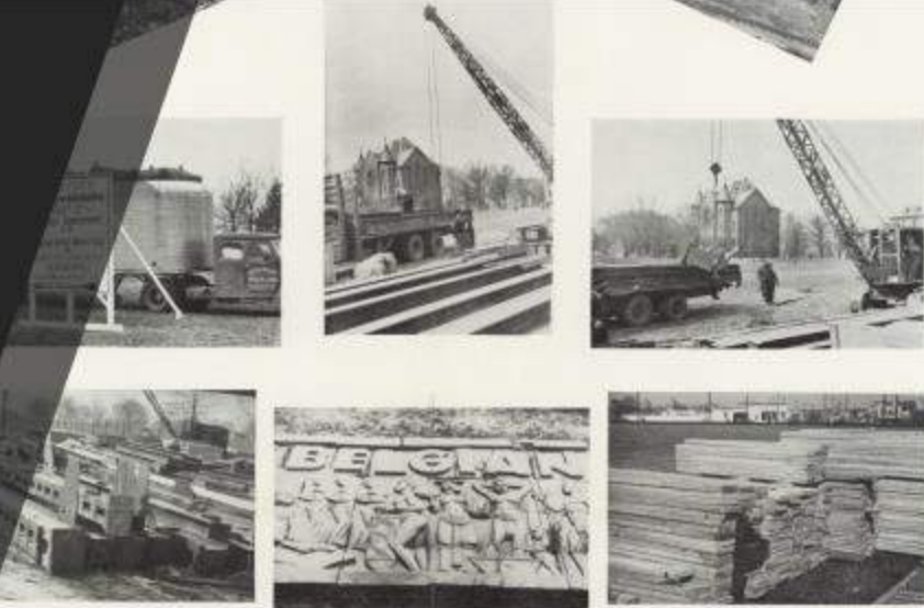
The Belgian Building, Fund