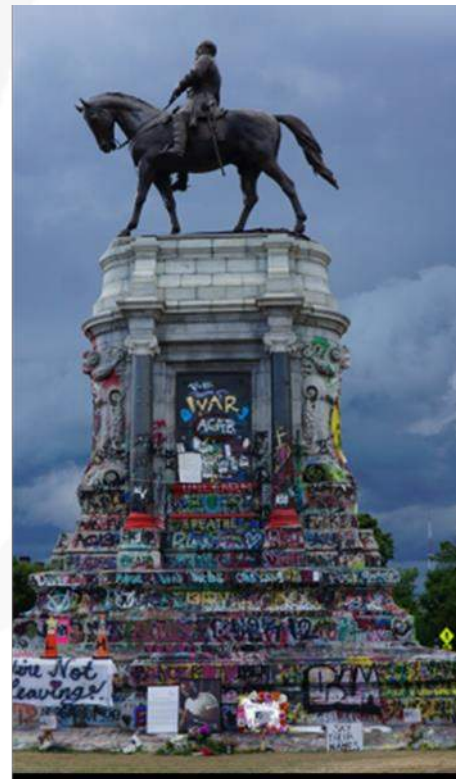
Robert E. Lee Monument Jean-Antoine Mercié, Sculptor Lee Circle, Monument Avenue July 22, 2020