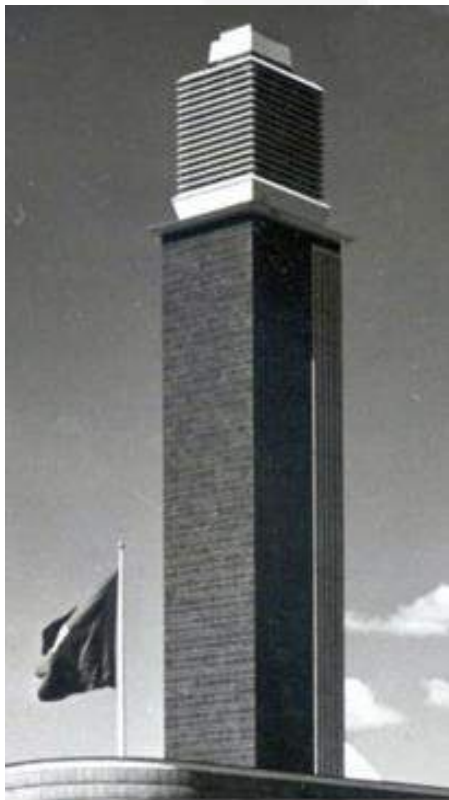
The Belgian Pavilion, Tower New York, NY World's Fair 1939