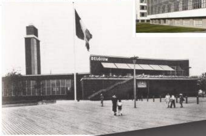
The Belgian Pavilion