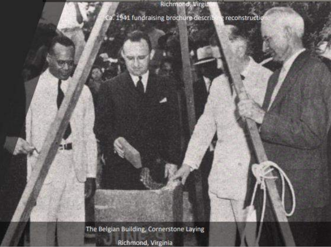
The Belgian Building, Cornerstone Laying