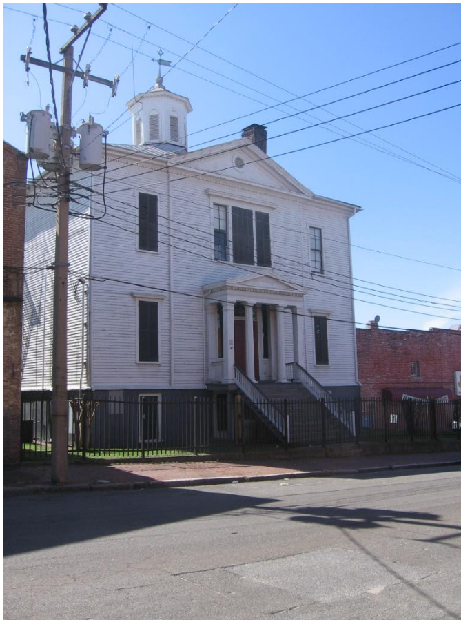
Northeast corner looking southwest