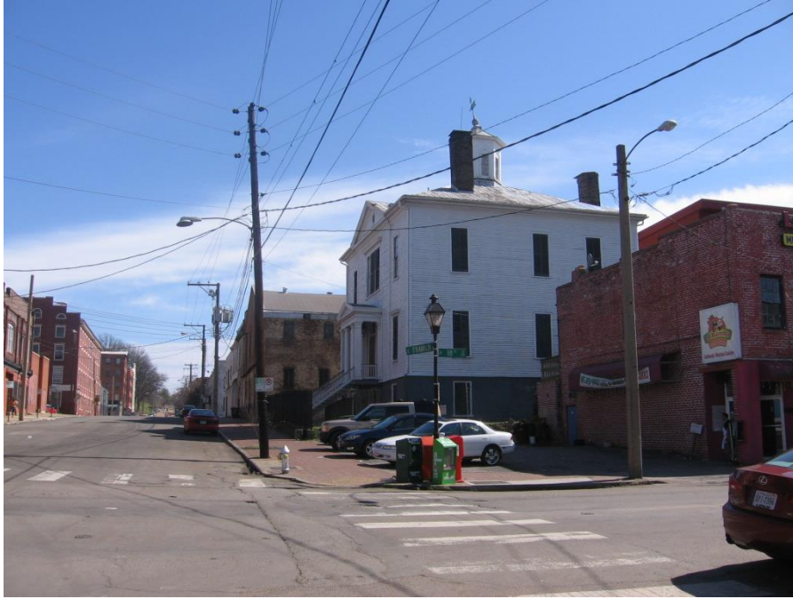
View from the intersection of N. 18 th and E. Franklin streets looking southeast