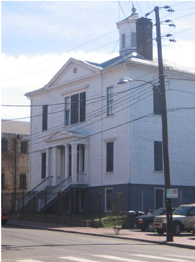
Northwest Corner looking southeast