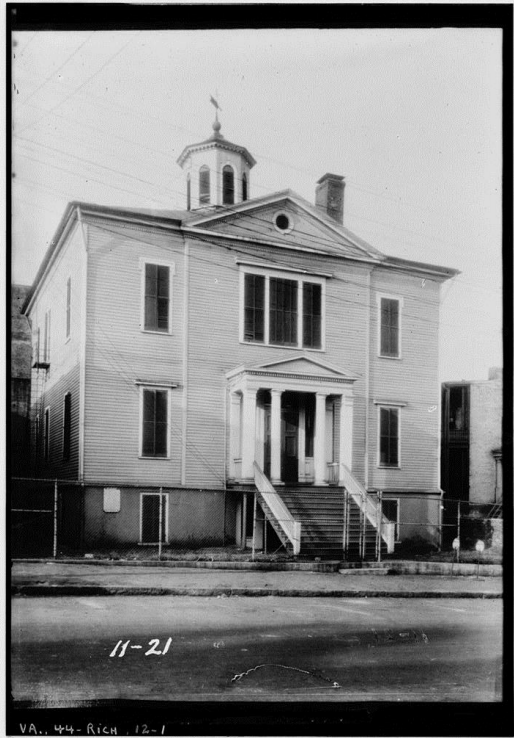
Photograph, ca. 1944

Carefully detailed sketches prepared by the Mutual Assurance Company for policies issued in 1802 and 1814, illustrate a two-story, five-bay frame building built on a high English basement with a low-hipped roof surmounted by an octagonal cupola. The façade was organized by a slightly projected, pedimented central pavilion. In the mid-nineteenth century, the façade was remodeled in the style of the time. The major alterations included the installation of classical pedimented portico with Tuscan piers and Doric columns, the removal of the two windows flanking the entrance, and the replacement of the arched window arrangement on the second story with a three-part window with a Greek cornice.