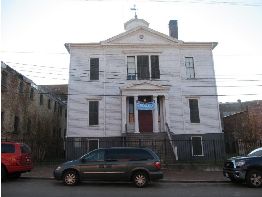
Façade, looking south