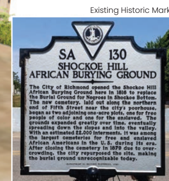
Existing Historic Marker

Approx. 14' tall mural with 3 painted stripes on all sides. White painted letters and numbers using vinyl stencils are located on the front and the back of the building