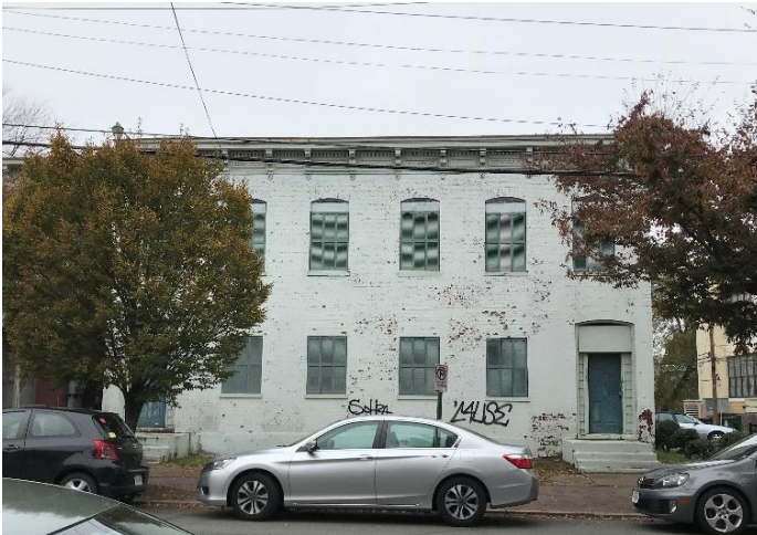
Figure 3. Façade, 2019.