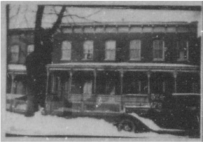
Figure 1. Assessor's record, ca. 1934-1956.