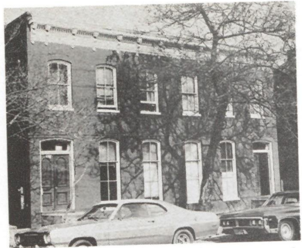
Figure 2. Jackson Ward Historic District book, 1978.