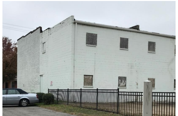
Figure 4. North and west elevation, 2019.