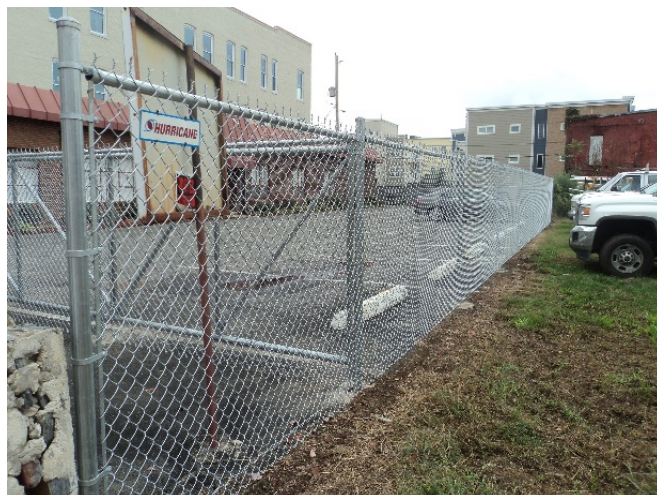
Figure 2. Installed fence, view of side yard.