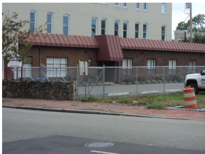
Figure 3. Installed fence, view from across West Leigh Street.