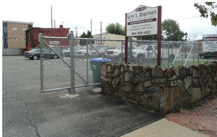
Figure 1. Installed chain-link fence, view from West Leigh Street.