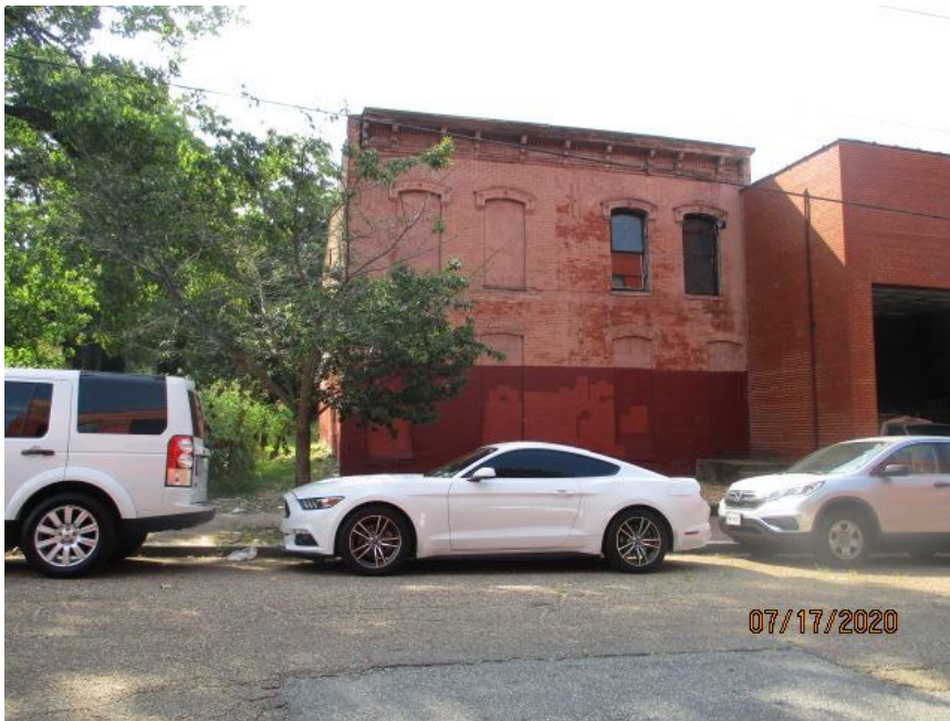
Figure 6: 209-211 N. 20th Street