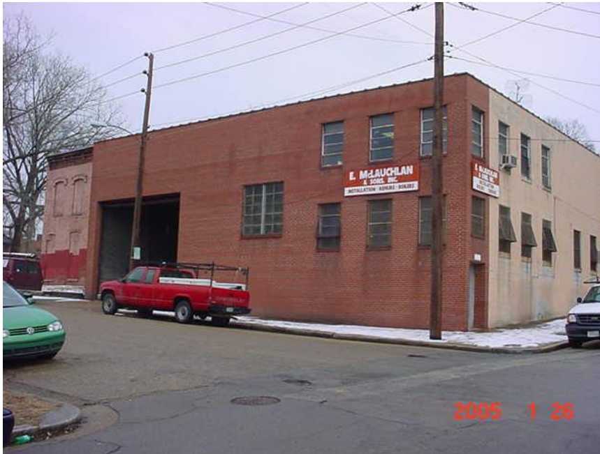
Figure 5: 2000 E. Grace Street