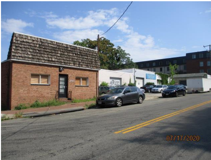
Figure 4: 200 - 202 N. 21st Street