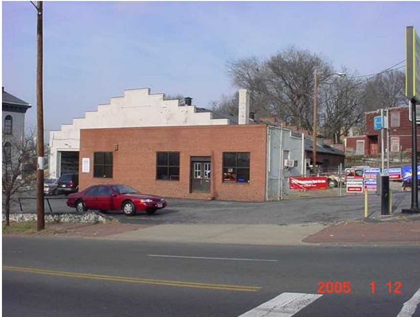
Figure 1: 2018 E. Broad Street