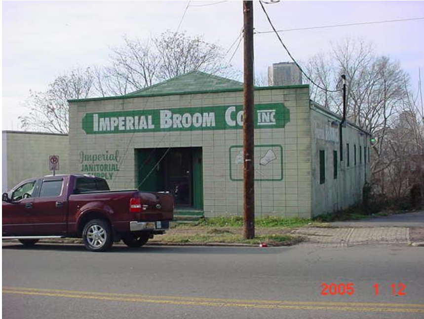
Figure 3: 214 N. 21st Street