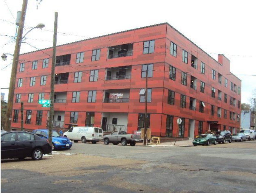
Figure 7: 2000 E. Grace Street