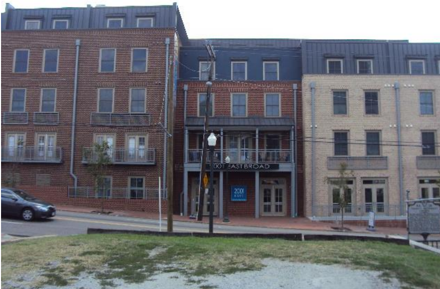
Figure 2: 2001 - 2021 E. Broad Street