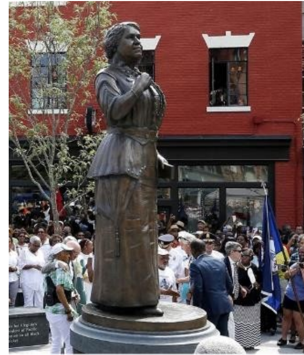
Maggie L. Walker National Historic Site in downtown Richmond, Virginia. Maggie Walker was an activist and entrepreneur for who OCWB has its namesake. Her life inspires our work.