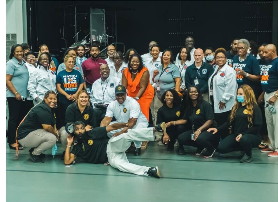
OCWB Staff and the City Ambassadors at a partner luncheon in 2022

A thriving community where all residents have equitable access to foster wealth and well-being.