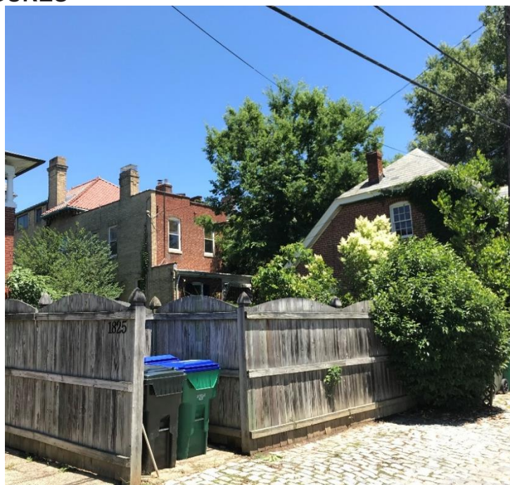
Figure 2. Rear elevation.