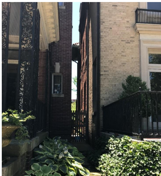
Figure 1. East elevation, looking south.