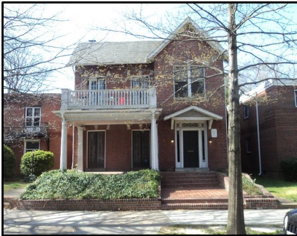
3021 Monument Avenue (April 2018)

Description of Existing Structure: The existing structure is a two story brick duplex with a frame rear addition built in 1927. The structure has been altered overtime to include the replacement of an exterior stair on the west side elevation.