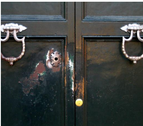
Figure 3. Il Buco Della Serratura, Villa del Priorato di Malta