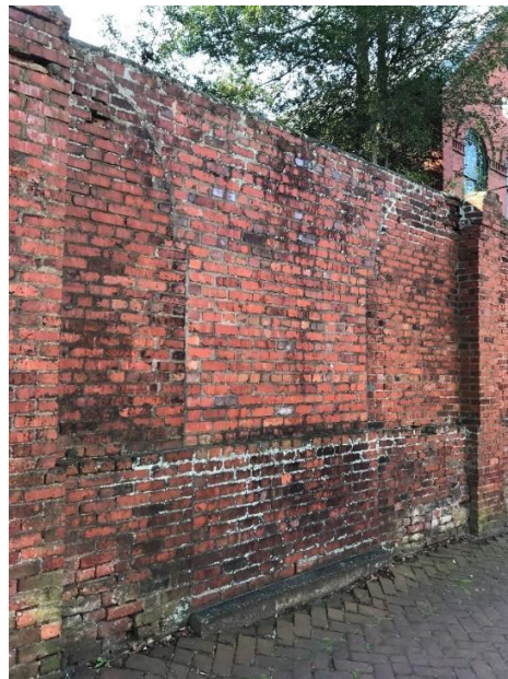
Figure 2. Detail showing deterioration and previous alterations.