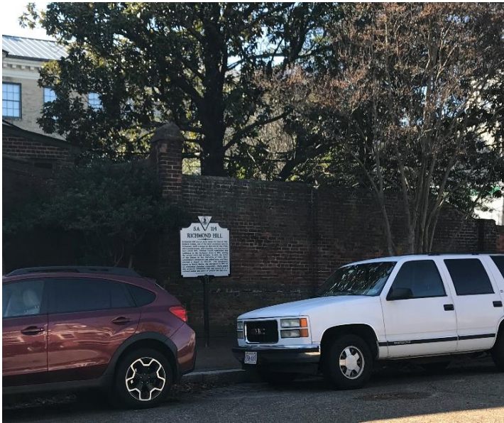
Figure 1. Location of proposed gate.