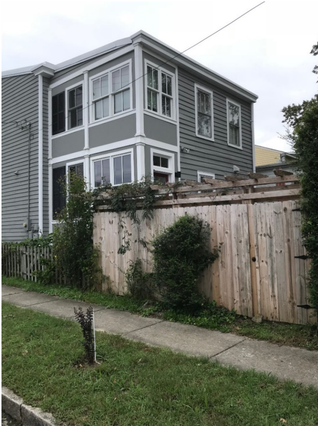
Figure 1. Rear of 726 North 27th Street.