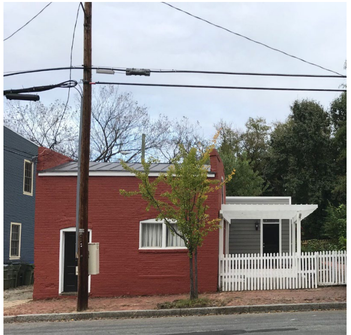
Figure 2. Pergola at 700 North 27th Street.