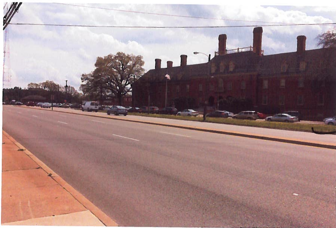
NICE SMALL RESID. AREA