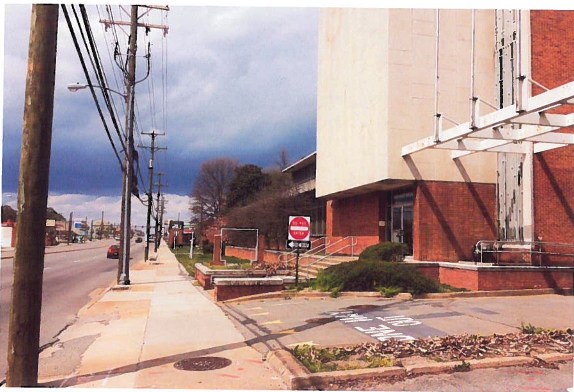
HEAVY DUTY OHV SHOWS UP @ ROSENBERG