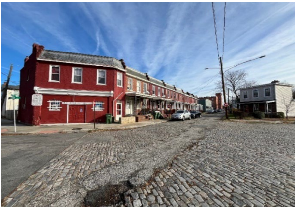
Figure 7. Block context. Intersection of Burton and Tulip Streets looking east down Burton Street.