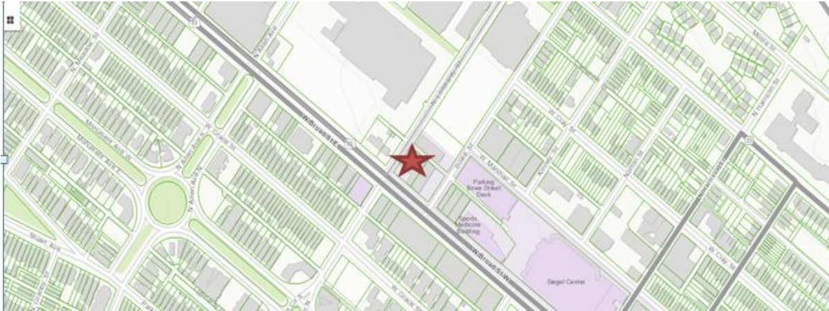
City of Richmond Parcel Map

The Property is located on the GRTC bus line and within walking distance of Kroger, Lowe's and VCU, among other retail uses. The GRTC bus line serves the area, and the Pulse will have a stop within walking distance.