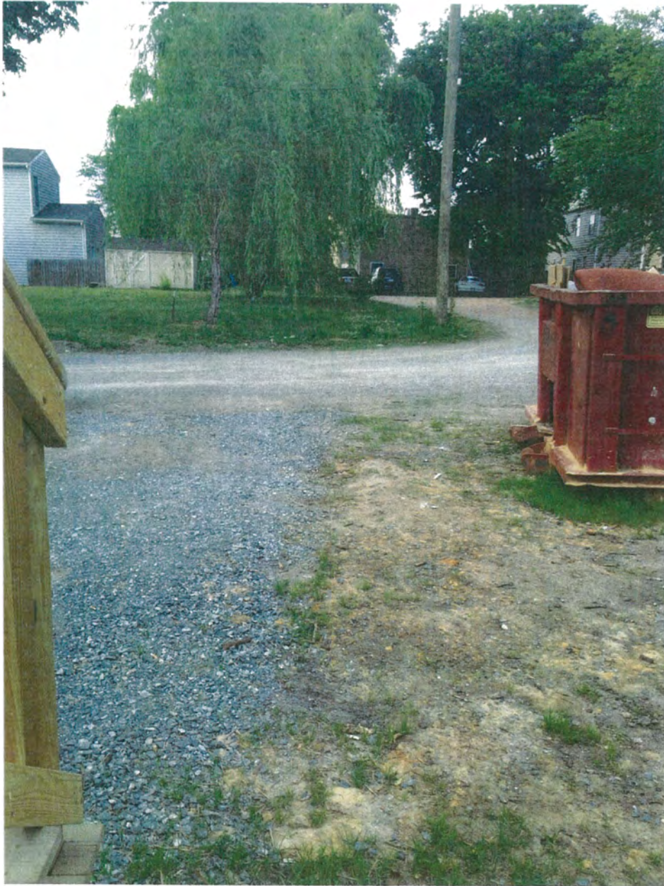
This is a view from the opposite direction, showing the alley at the back of the house.