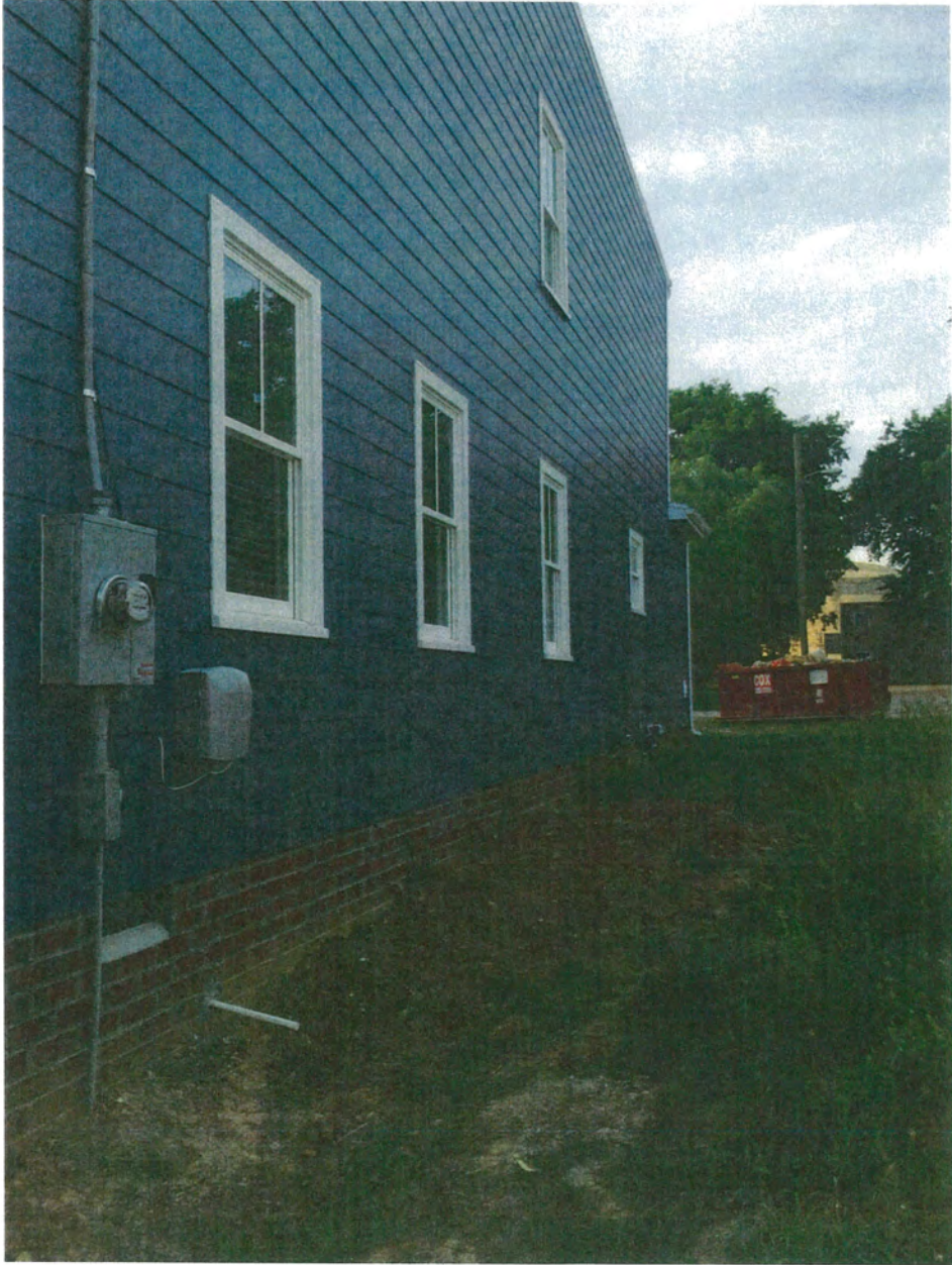
This is a view of the side of the house.