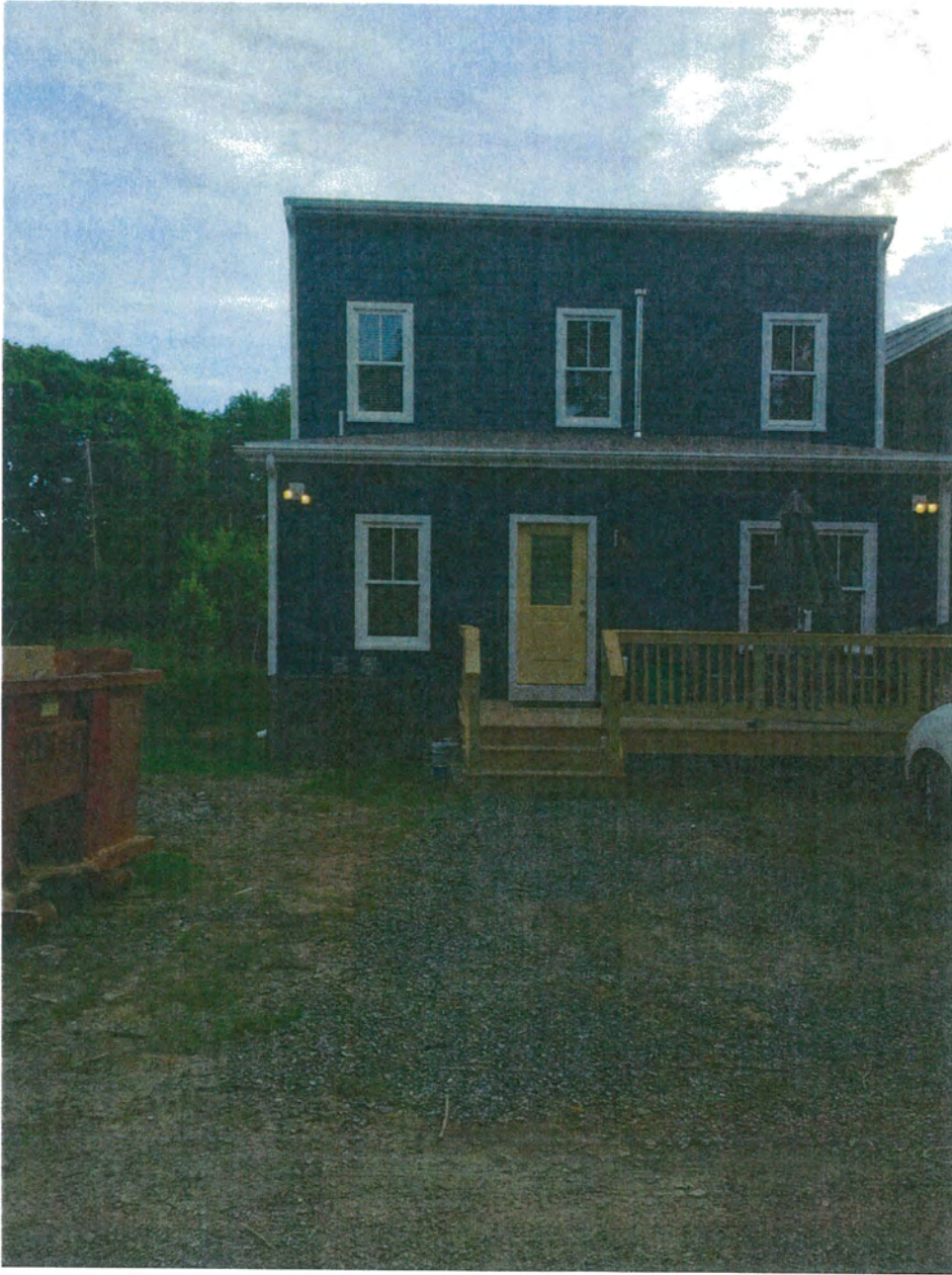
The shed would be situated in the lower left area on the photo above.