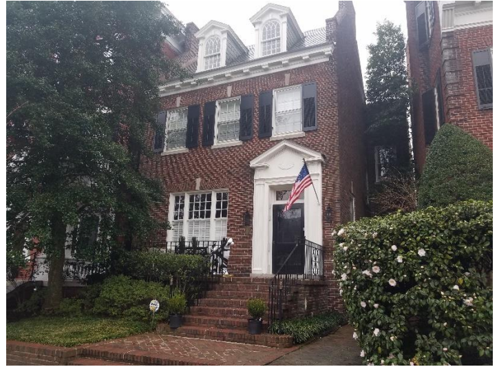
Figure 2. 1635 Monument Avenue.