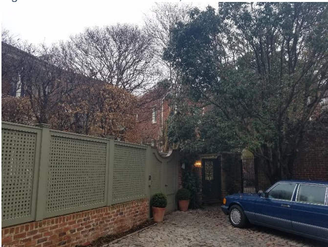
Figure 5. 1635 Monument Avenue, view from alley.