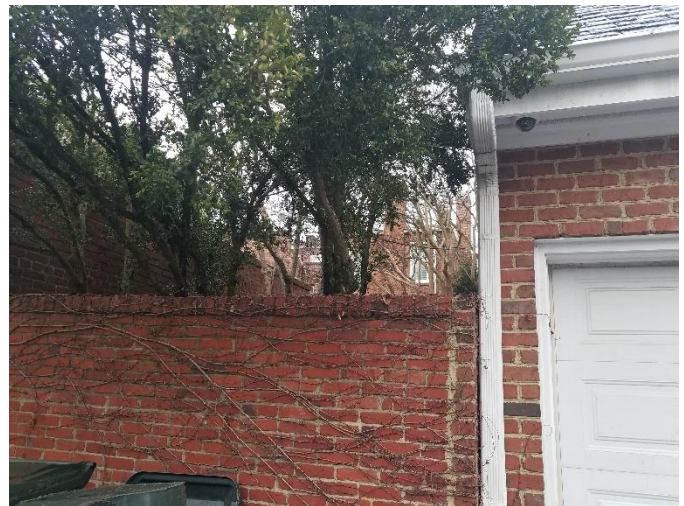
Figure 4. 1635 Monument Avenue, rear elevation.