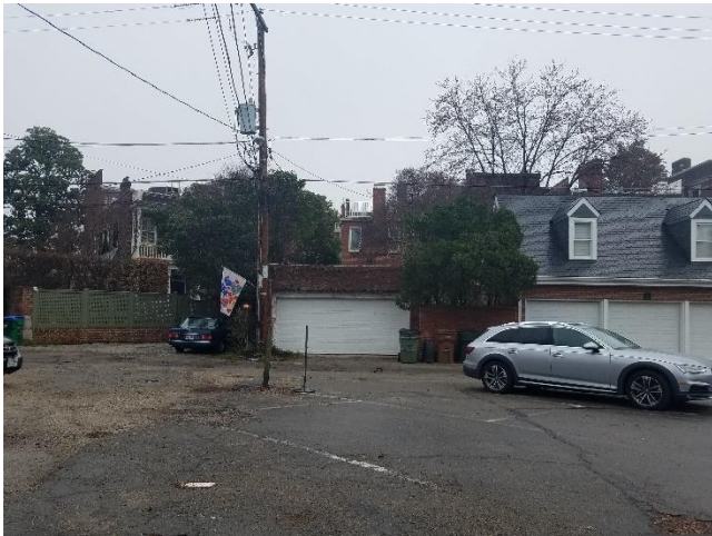
Figure 3. 1635 Monument Avenue, rear elevation.