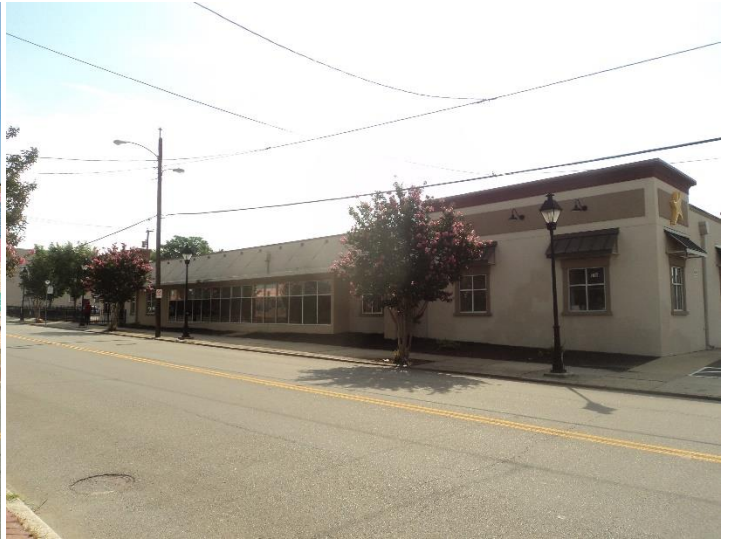
Figure 2. Odd side of North 25th Street, looking northeast, outside of district