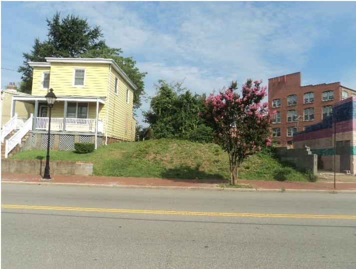
Figure 1. 918 North 25th Street