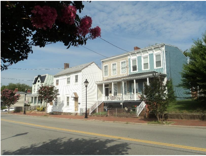
Figure 3. Even side of North 25th Street, looking southwest