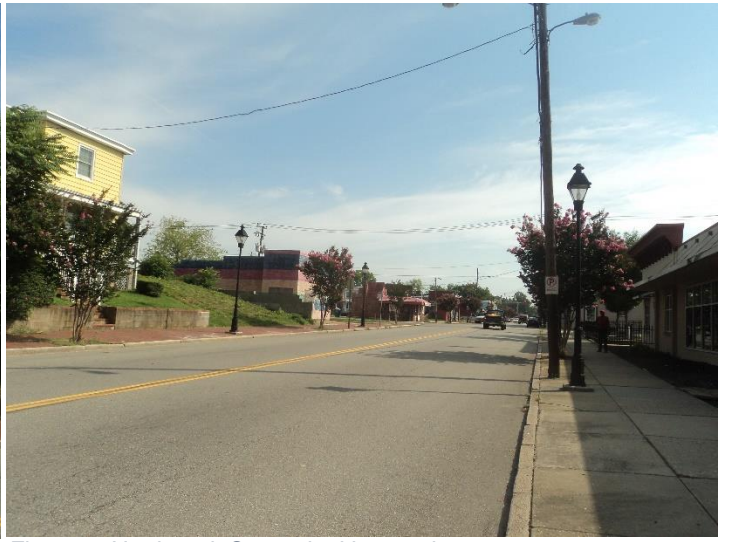
Figure 4. North 25th Street, looking north