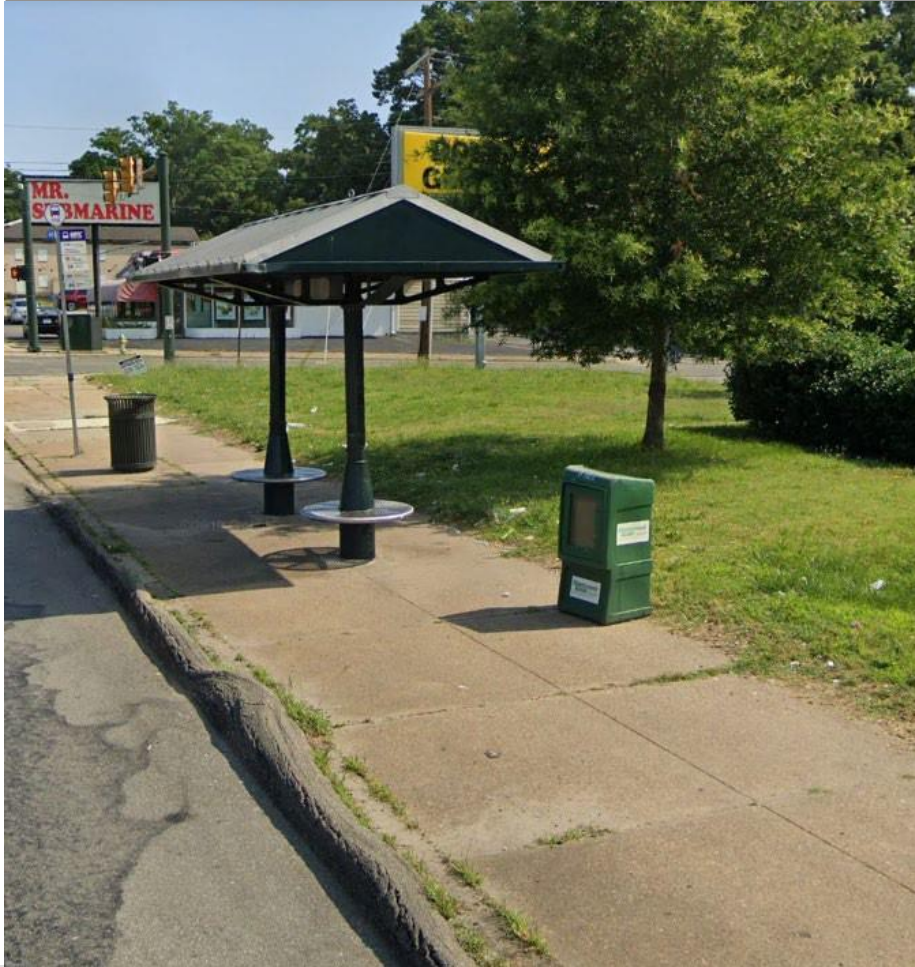
Option 1 - stop 1426 at Jeff David & Ruffin