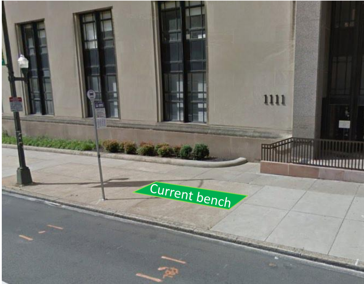
Option 1 - stop 352 at Broad & 11 th