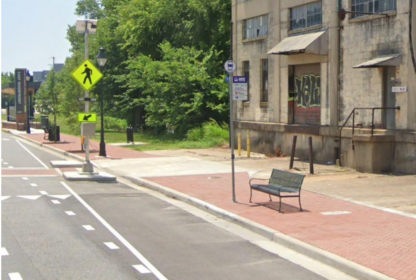
Option 1 - stop 3678 at Main at East Riverfront