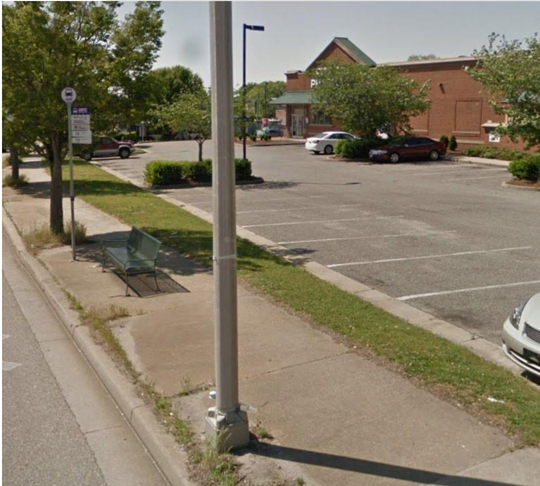
Option 1 - stop 792 at Cowardin & Bainbridge