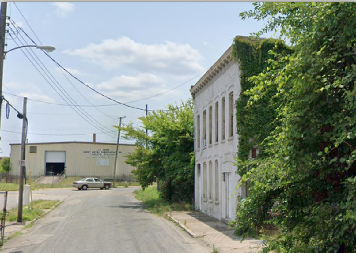
West 21 st Street Looking South