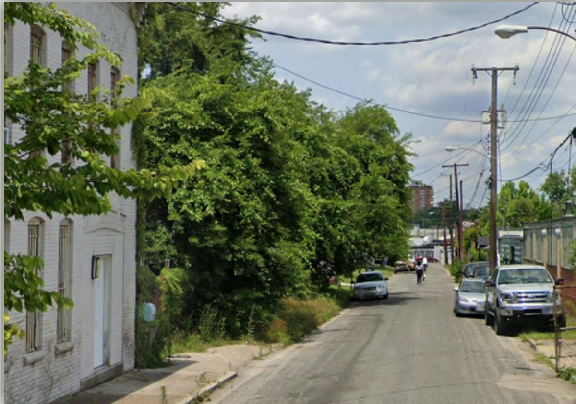
West 21 st Street Looking North