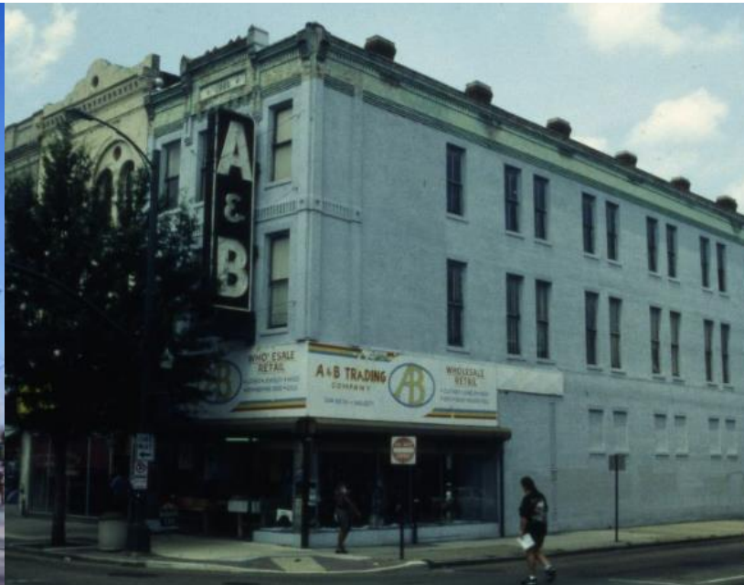
Figure 4. Historic photo of the building from the 1990s showing a light blue paint color.