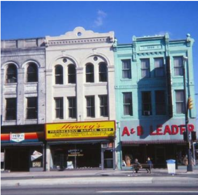
Figure 3. Historic photo of the building with a bright light blue color.