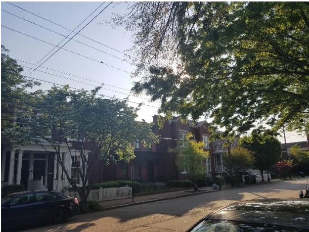
Figure 3. View east along West Clay Street towards 128 W. Clay.