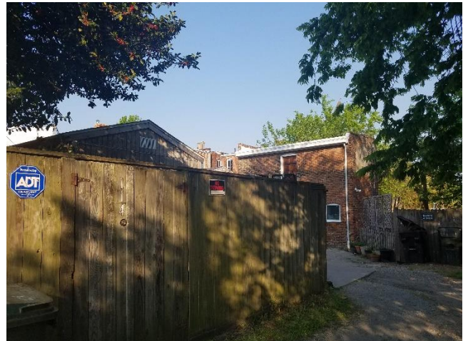
Figure 4. View towards the rear of 128 W. Clay from the partial alley. The two-story brick building is behind 122 W. Clay Street.