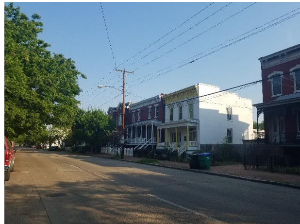
Figure 2. View west along West Clay Street towards 128 W. Clay.