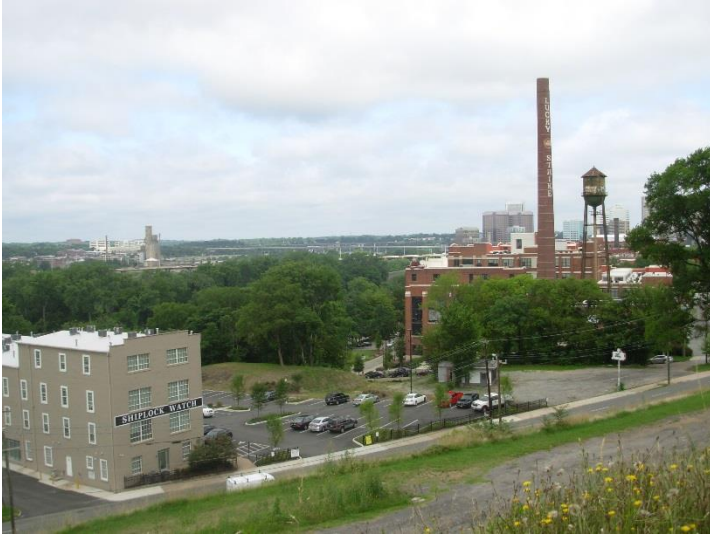
View of subject property from Libby Hill