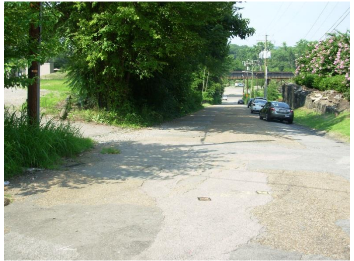
Pear Street Frontage