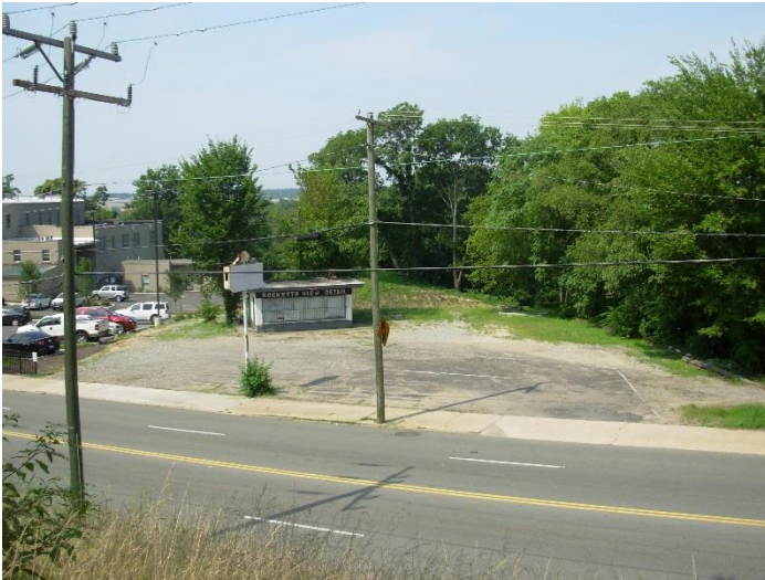
Main Street Frontage