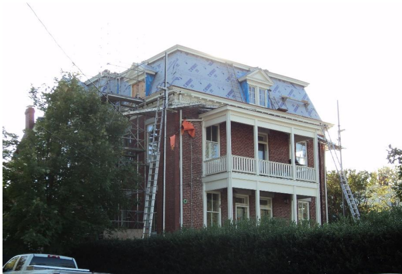
Figure 1. View of rear elevation from North 36th Street