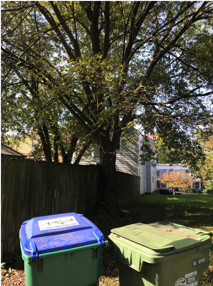
Figure 3. View of the rear from the alley.