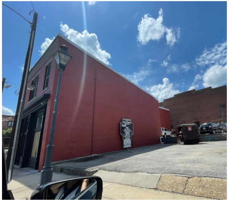
Figure 4. Current photo of north elevation of building, site of proposed mural