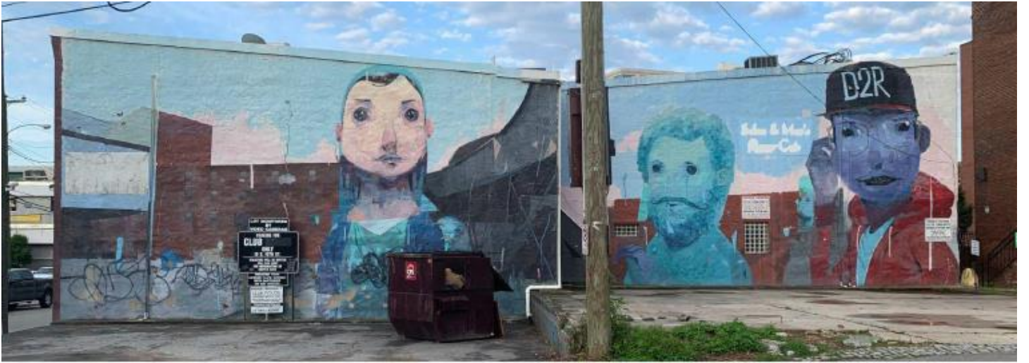
Figure 5. Mural on north side of the building, painted over in 2021.