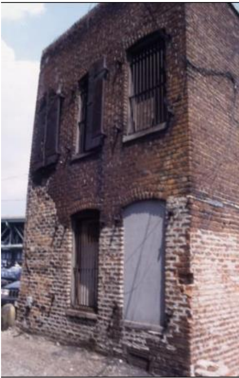
Figure 3. 1998 photo of rear of building, altered later.