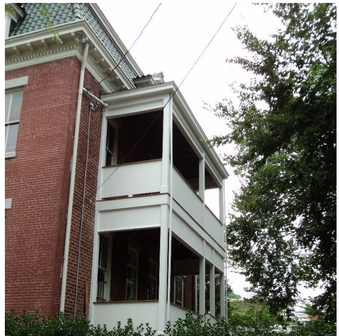
Figure 2. Rear porch, July 2011