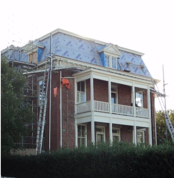
Figure 1. View of rear elevation from North 36th Street