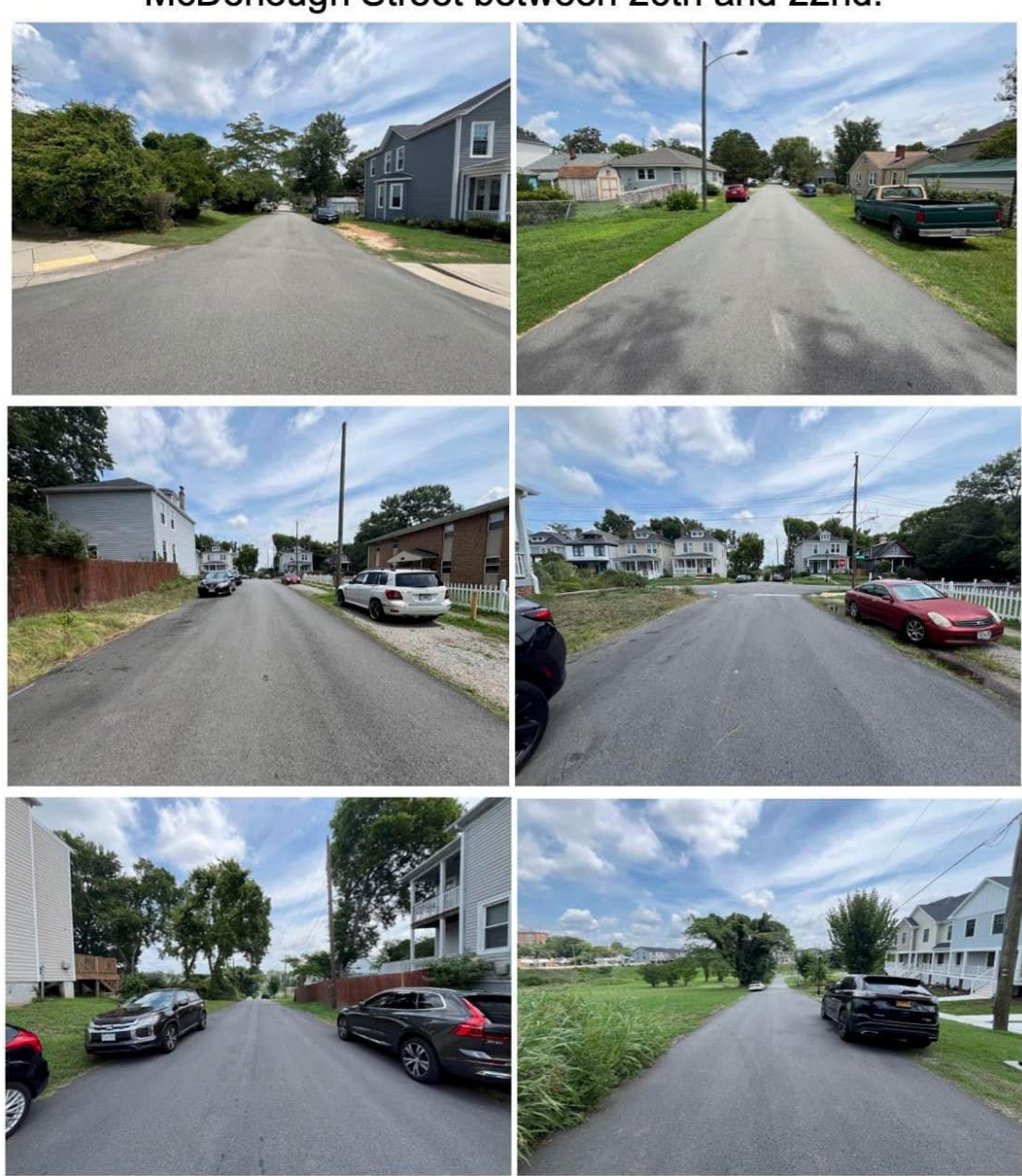
McDonough Street between 26th and 22nd.