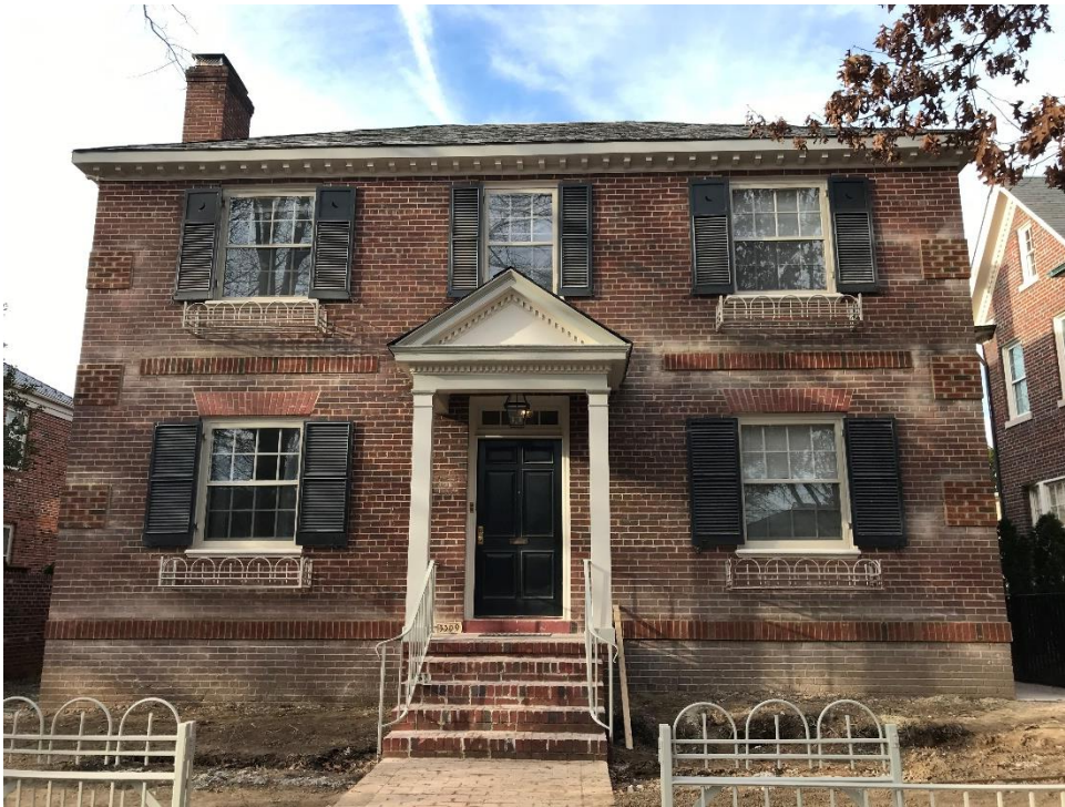
Figure 2. March, 2019