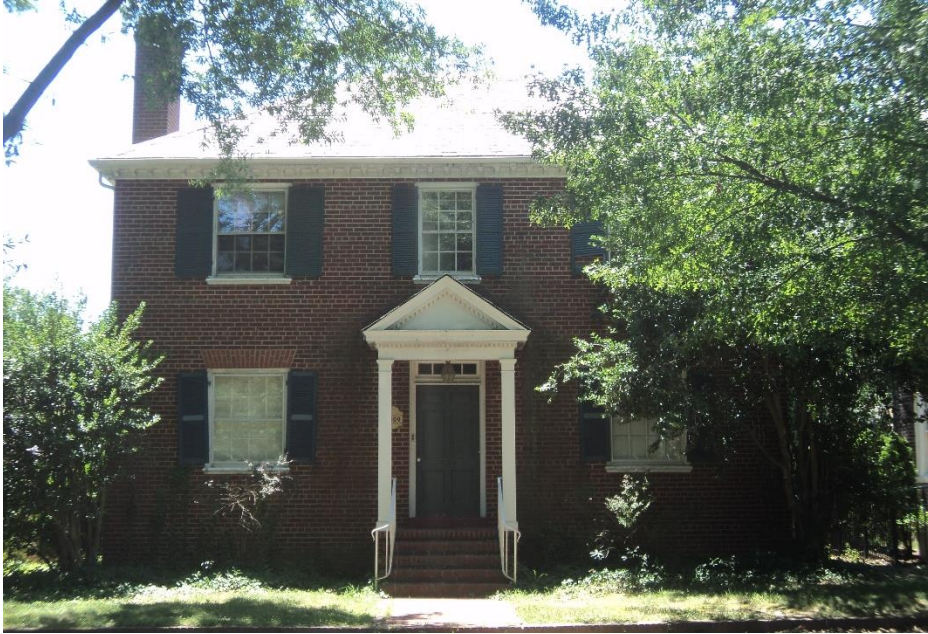
Figure 1. July, 2018