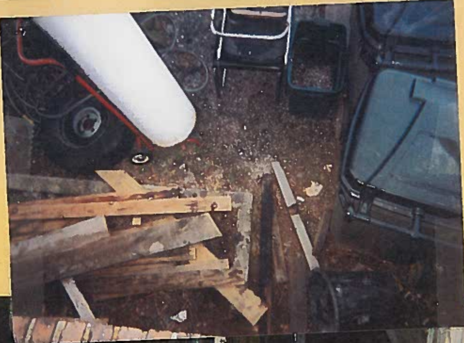
Left My Porch Front railings + brick wall