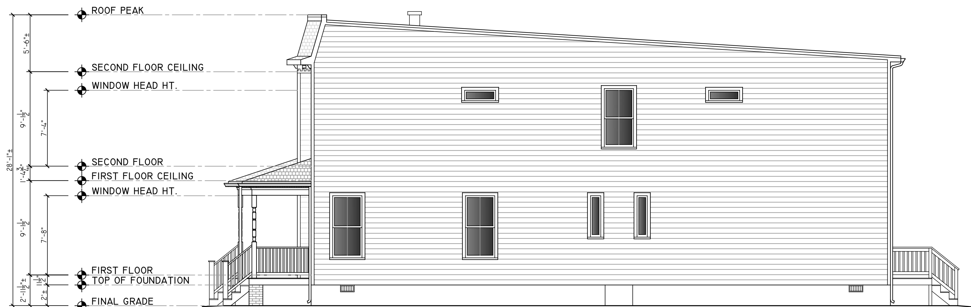
02 RIGHT SIDE ELEVATION