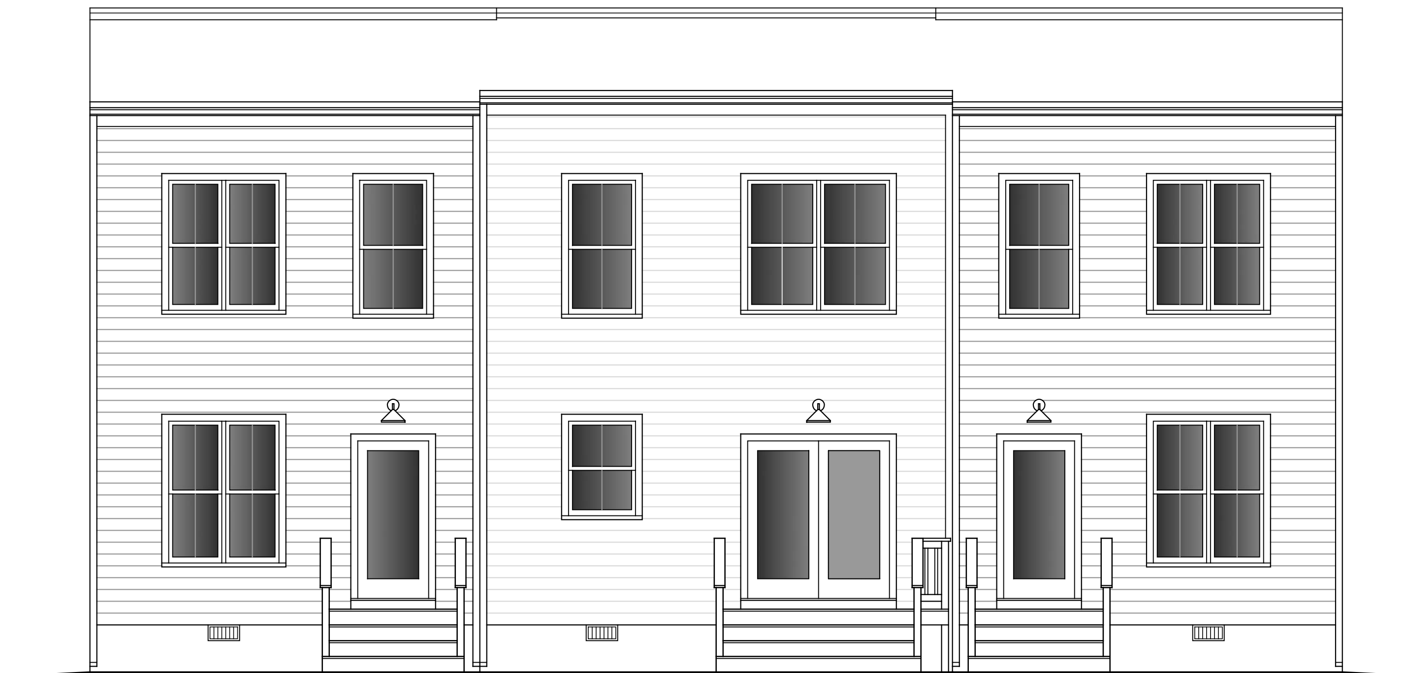
02 | REAR ELEVATION 1/4" = 1'