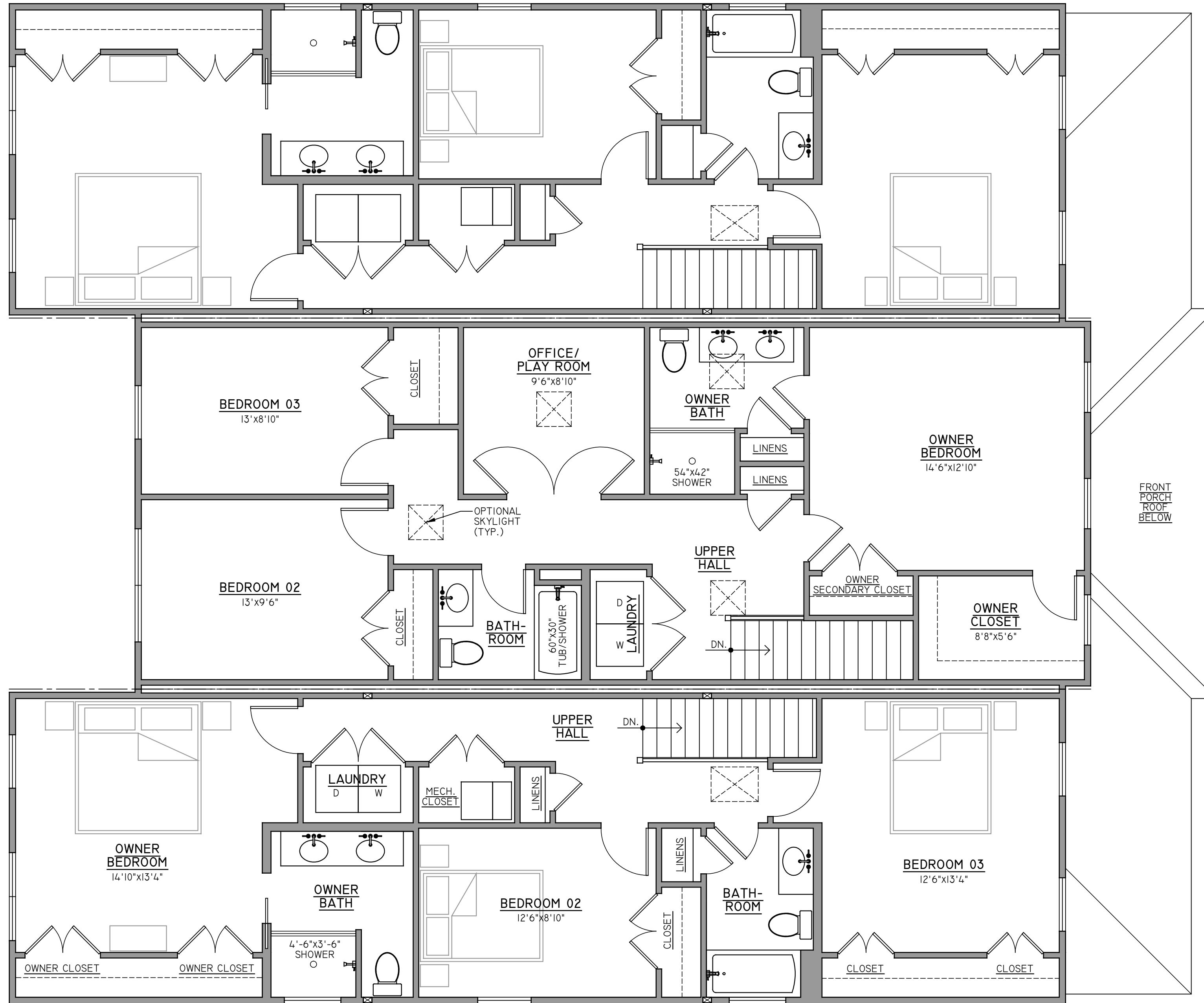
01 | SECOND FLOOR PLAN 1/4" = 1'

PROJECT CONTACTS: DEVELOPER: MATT JARREAU 804-306-9019 CONTRACTOR: KIWI DEVELOPMENT 804-869-8600 ARCHITECT: CHRISTOPHER WOLF CHRIS WOLF ARCHITECTURE, PLLC 804-514-7644