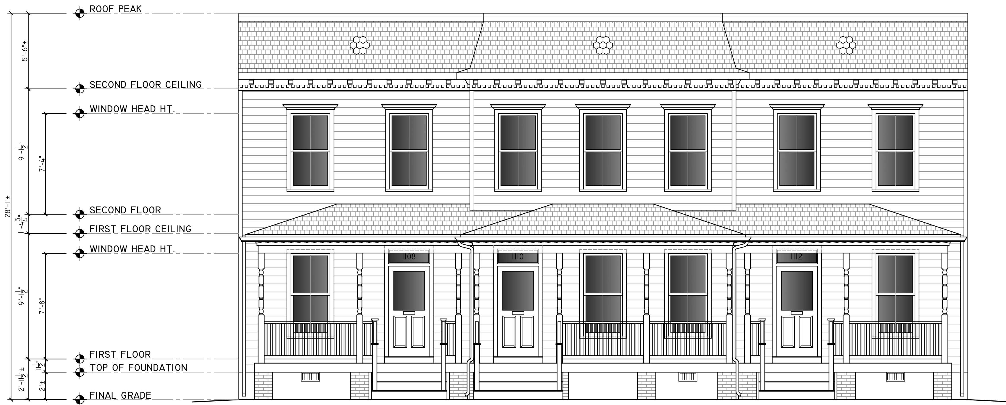
01 | FRONT ELEVATION 1/4" = 1'