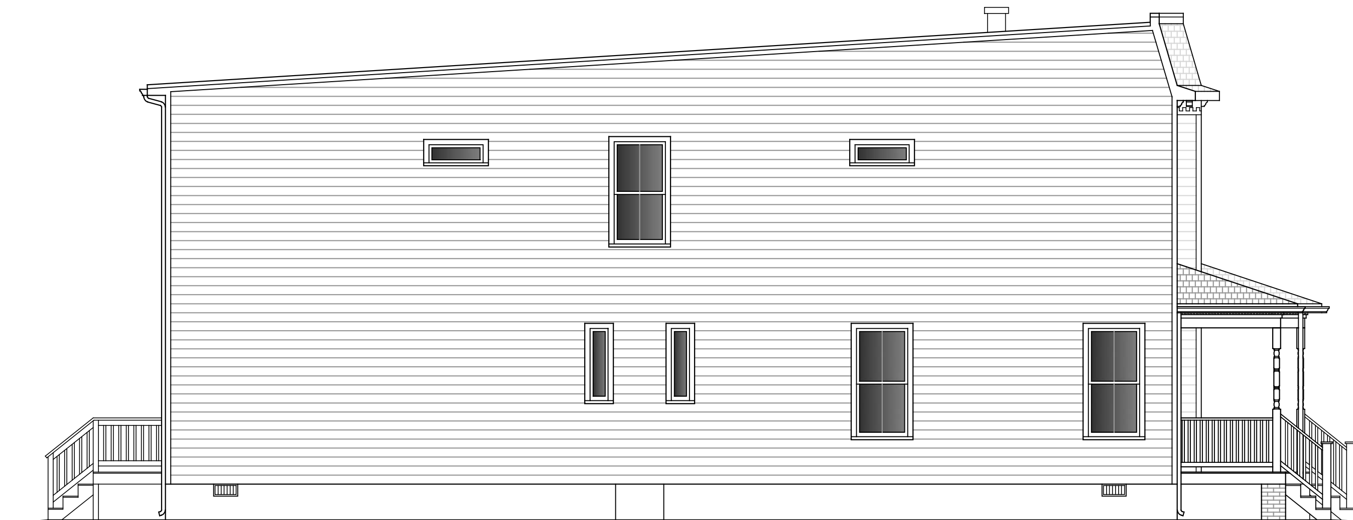
01 LEFT SIDE ELEVATION

ARCHITECT: CHRISTOPHER WOLF CHRIS WOLF ARCHITECTURE, PLLC 804-514-7644