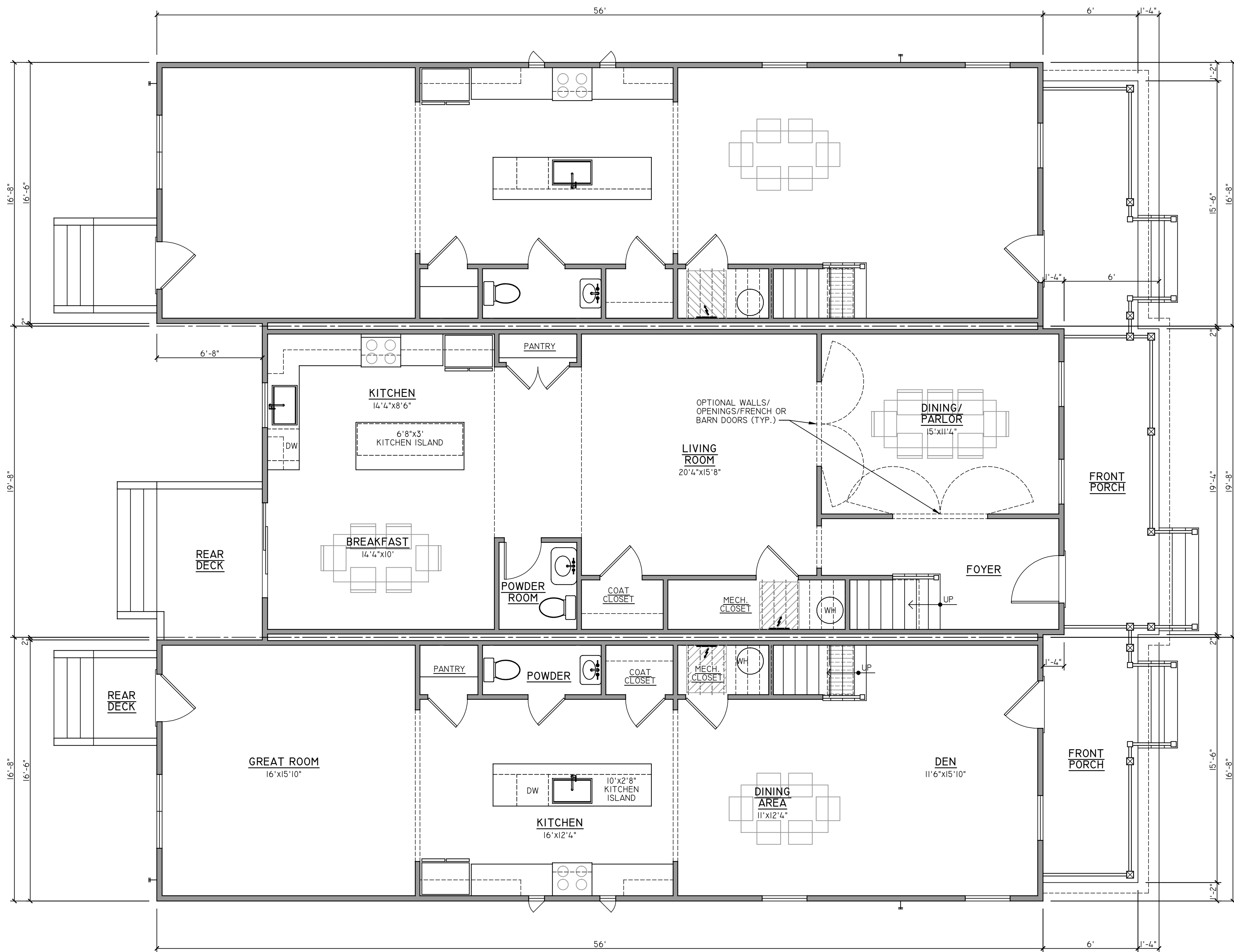
01 | FIRST FLOOR PLAN 1/4" = 1'

SQUARE FOOTAGE: OUTSIDE UNITS- 1,864 S.F. CENTER UNIT- 1,992 S.F.