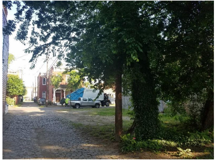
Figure 2. 519 St. James Street