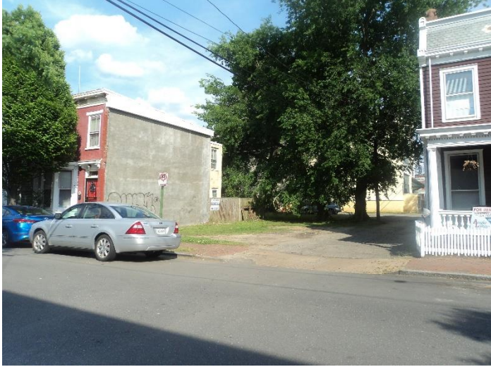
Figure 1. 519 St. James Street