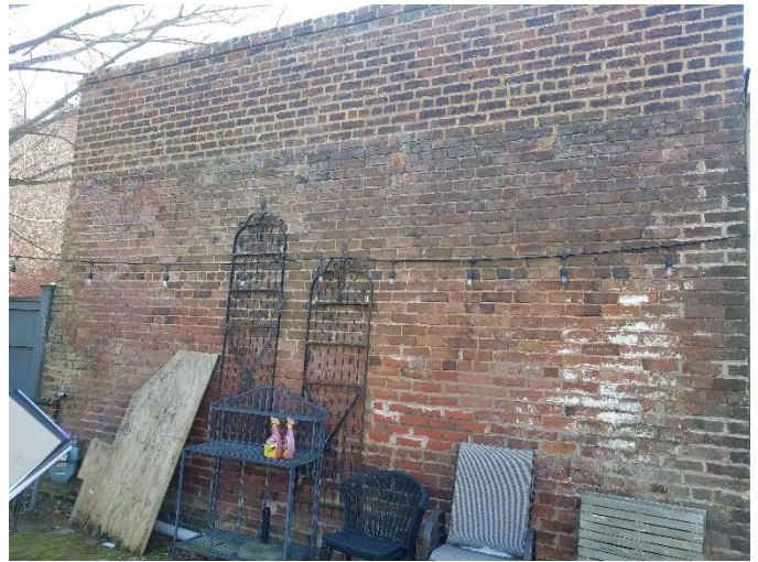
Figure 2. 2220 East Grace Street, rear elevation and location of proposed awning.