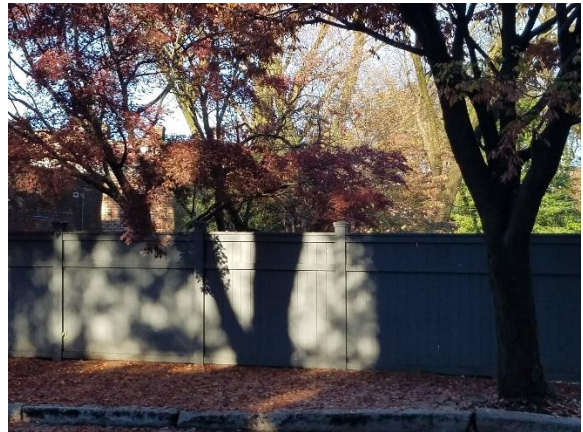
Figure 4. Privacy fence, view from North 23rd Street to approximate location of the proposed gazebo.