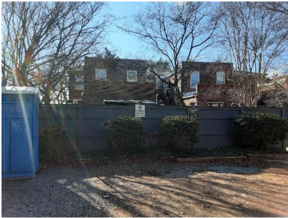
Figure 3. 2218 East Grace Street, rear yard, approximate location of proposed new gazebo.